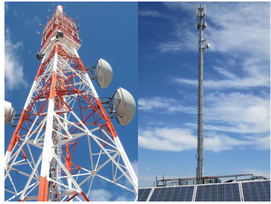
Fig. 1. Antennas mounted on a lattice tower (on the left), antennas mounted on a monopole (on the right).

Standards are a very important part of engineering practices, serving as rules that engineers must comply. Structural design