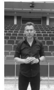
Figure 1: Example screenshot from video material.

To check whether participants who thought they might have to take the exam next year actually followed the central processing route, participants, after listening to the speech, were presented with three 7-point Likert scale items on the level of elaboration about the exam ( \alpha=.78 . Example item: The final general exam will influence my life ). Participants in the Central condition showed more elaboration ( M=4.5 , SD=1.19 ) than participants in the Peripheral condition ( M=2.73 , SD=0.97 ), t_{(112)}=8.85 , p<.001 .