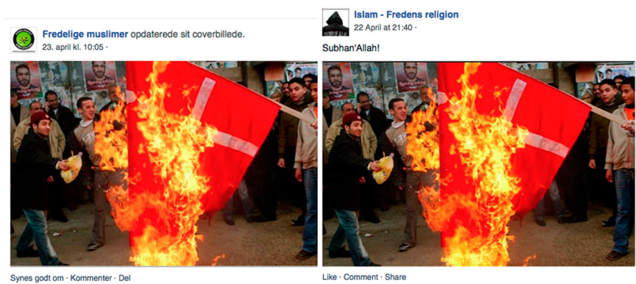
Figure 2. Pictures of burning Danish flags on two fake Muslim Facebook pages. (© Ritzau Scanpix/Nasser Ishtayeh/AP).

The constructed logics of violence, exploitation, hypersexuality and conspiracy connect to a fifth overarching logic, namely incompatibility . Muslims are fundamentally incompatible with Danes and Danish society, meaning that 'the Muslim' is constructed as the exact