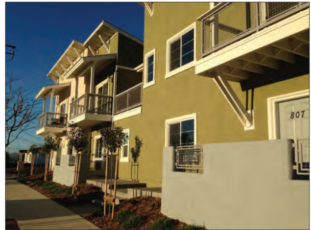
Figures 6 a & b: Moylan Terrace in San Luis Obispo features 29 units (36% of total units) for very low to moderate income families juxtaposed in a seamless and invisible manner with market rate.