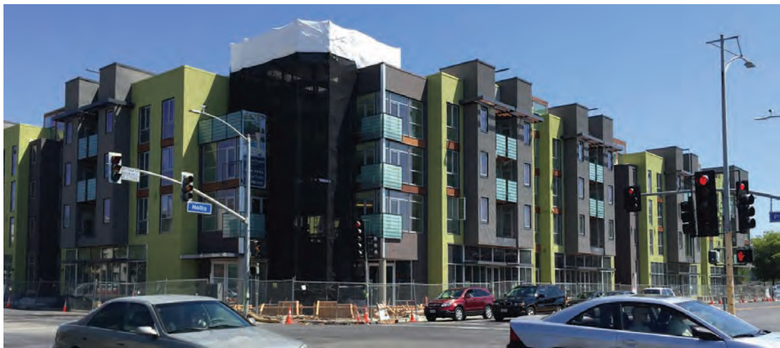
Figure 4: Parc on Powell in Emeryville received parking, density, height and setback variances and benefitted from city ownership of the parking structure to help create 36 (22% of total units) below market rate units.

Profits from sale of units at market rate, as well as from commercial and retail/service space sold or leased at market rate have cross-subsidized the price of units for low and moderate-income households (Figure 6 a & b). In one case, direct transfer of in lieu fees captured from a commercial development to land held in trust for affordable housing provided interim financing for predevelopment costs, allowing