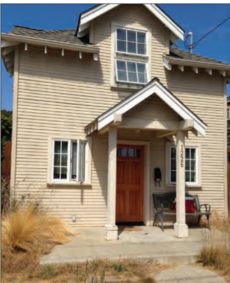
Figure 3: Accessory Dwelling Unit (ADU) in Santa Cruz resulting from adopting the prototype designs commissioned by the city.

space, storage or workshop), or put to a different use (nursery, guest room, accessory dwelling unit). This flexibility promises to provide a hedge against obsolescence (Figure 3).