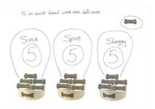
Figure 2: Fred's screen with his solution (a sketch is also provided as the iPad screen is not clear)