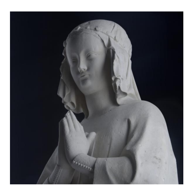
Figure 2 Statue of Princess Isabella of France, ca. 1300 Dominican nunnery at Poissy