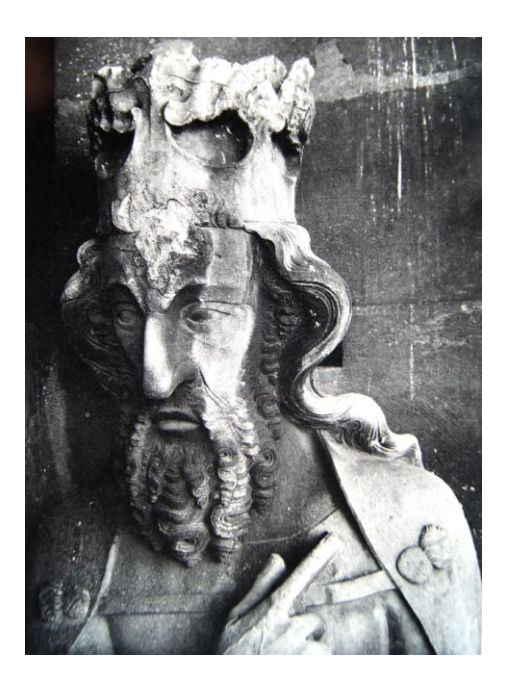
Figure 4 Statue of a king, fragment, Reims Cathedral, ca. 1360, after: Gerhard Schmidt, Gotische Bildwerke und ihre Meister, Wien-Köln-Weimar: Böhlau Verlag, 1992, fig. 115.

was shown as an old man with a long beard arranged in curls and shoulder-length curly hair. The rendering of the head seems to be realistic at first glance, but Gerhard Schmidt has demonstrated its amazing similarity to the youngest sculptures in the so-called royal gallery at Reims Cathedral. (fig. 4)<sup>41</sup> The Cracow statue recreates the majestic image of an ideal ruler, derived from the tradition of the kings of Israel, among others. What we see here is a carefully selected physiognomical type whose function it was to represent the ruler as a sage radiating with wisdom and displaying a stern countenance, one that was modelled on the representations of the great wise men of ancient times, Old-Testament prophets, apostles and other illustrious men of the past worthy of the highest esteem.