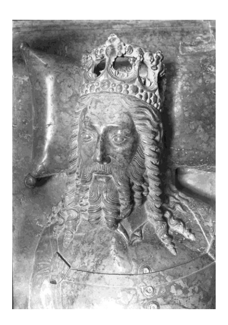
Figure 3 Tomb monument of Casimir the Great , fragment, ca. 1370, Cracow Cathedral, photo: Print Room of Polish Academy of Arts and Sciences

distinctiveness and sovereignty. The importance of many these 'early' portraits lies therefore not so much in realistically rendered faces; in fact, these images are often hardly realistic – rather they stand somewhere half-way between the conventionalized likeness and the realistic one, they present often not so much a real face of an individual as an individualized type of physiognomy that has been invented exclusively for one individual. Their importance is due to the fact that they challenged established norms and conventions, they focused the viewer's attention not only on the identity of the person understood in purely social terms, but displayed also something that can be called personal identity, presenting this person with an individualized physiognomy they distinguished him or her from others, and somehow rose above established limits of social norms.