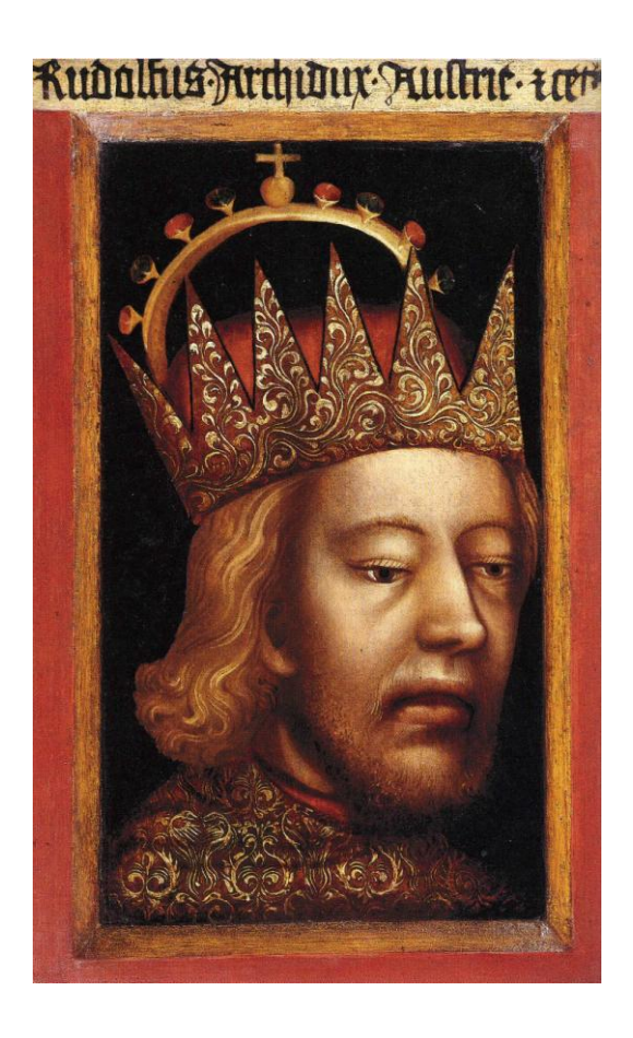
Figure 9 Portrait of Rudolph IV, Archduke of Austria, Dom- und Diözesanmuseum, Vienna

Northern Europe (distinctly apart from the Louvre's medieval collection located in the Decorative Arts and Sculpture galleries)<sup>80</sup>. The latter panel waited a little longer to be included in the art-historical debate, but this painting had also become part of the developmental chain whose links reached from medieval forms of representation to the modern art of portraiture. In 1933 Johannes Wilde, in a recapitulation of a short notice written on the occasion on the panel's conservation treatment and its transfer from the archive of the Vienna cathedral chapter to the newly established cathedral museum, noted that '[it] is the oldest independent portrait in German art'.<sup>81</sup> Although Wilde's text dealt exclusively with formal and technical issues, the scholar felt it was his duty to emphasize the fact that the panel was not only an important historical artefact, but also a work of art that was of significance for the history of painting. Earlier, the portrait of Rudolph IV had been