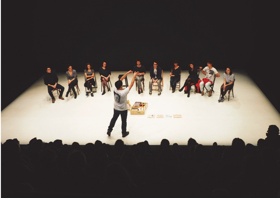
Figure 3: Tiago Rodrigues' By Heart . Courtesy of Magda Bizarro and Mundo Perfeito

to learn the Sonnet to end granted them the role of co-creators of a section of the performance along with Rodrigues, a more substantial role than that envisaged for the audience that participated in the Lear discussed earlier.