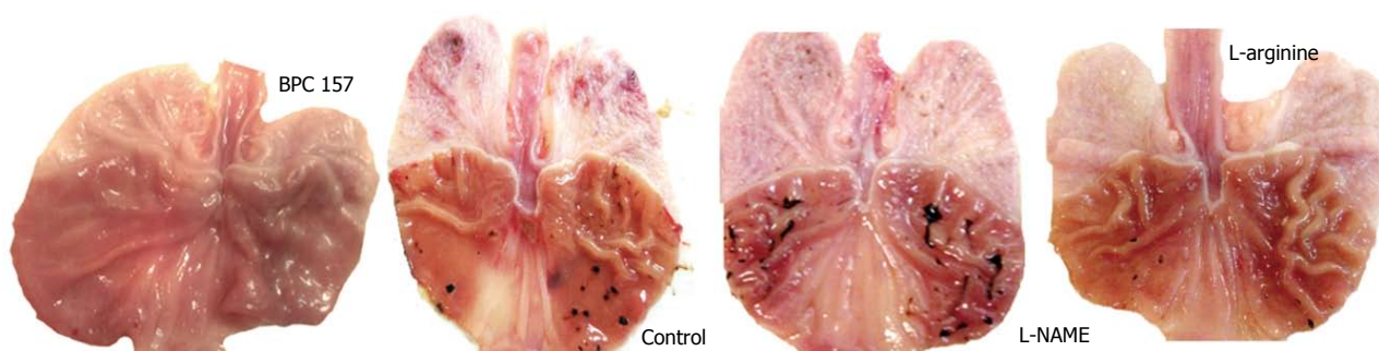
Figure 1 Gross presentation of celecoxib-induced gastric lesions at 48 h.

half of the mucosal thickness to full-blown ulcers; the defect bed was debris-covered, partially by erythrocytes, and it was surrounded by an edematous lamina propria with polymorphonuclear infiltration) showed a gradual increase from 24 h to 48 h after administration, while the liver and brain lesions showed sustained levels (Table 1, Figure 1).