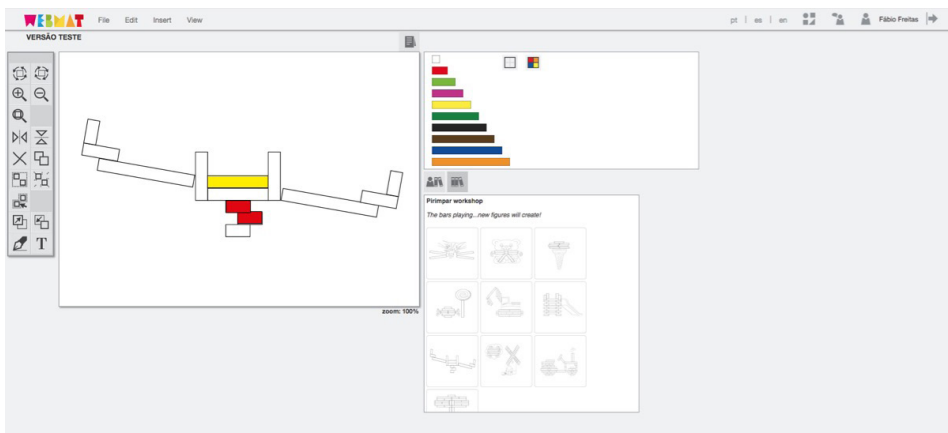
Figure 1. Example of WEBMAT® working environment.

The building process of WEBMAT® is based on the Hybrid Methodology of User-Focused Development (A. P. Costa, Loureiro, & Reis, 2010; A. P. Costa, Reis, & Loureiro, 2014) and proposed by Costa (2012). According to this author, "user involvement in the development process provides a source of knowledge about the context of use, tasks, and the way in which users tend to later work with the software" (pg. 182). This methodology privileges the integration of users in the early stages of the development process of a product. Accordingly, and with a view to obtaining data that would allow us to establish how users explore the platform, we decided to adapt this methodology, which facilitates the collection of evaluation data from usability and the UX.