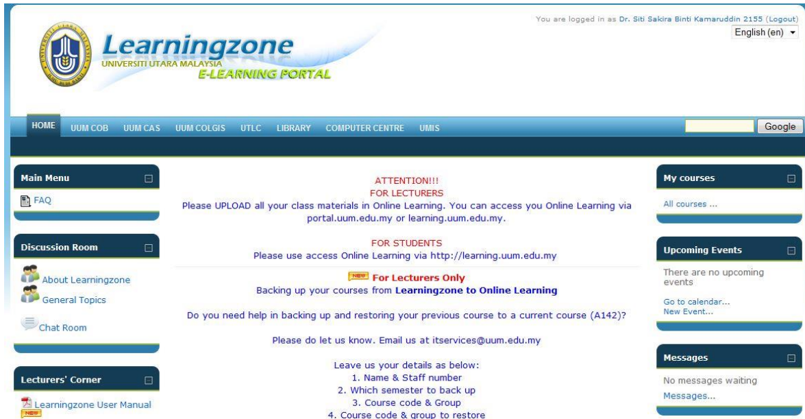
Figure 1: Snapshot of the Learningzone

UUM had a center called UUM Information Technology (UUMIT), which was responsible in developing and maintaining all IT related systems in the campus including the Learningzone and UUM Online Learning.