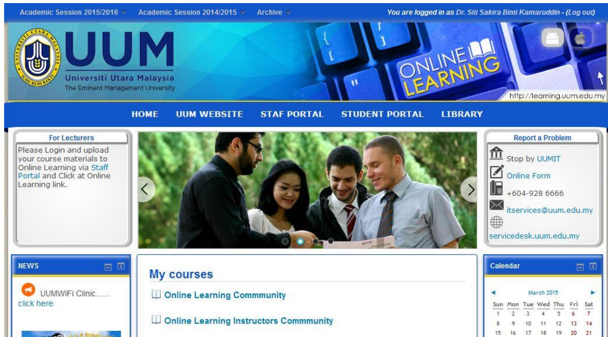
Figure 3: Snapshot of the UUM Online Learning