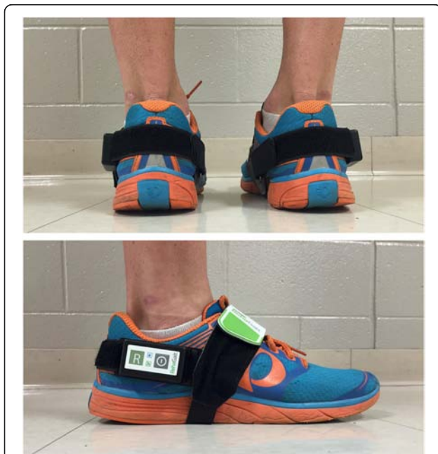
Fig. 1 Photograph showing the sensor placement on the lateral aspect of subjects' personal shoes

All statistical analyses were carried out in SPSS Version 22 (IBM Corporation, Amonk, NY). Separate 2 (device: RehaGait® vs. treadmill) × 3 (speed: normal vs. slow vs. fast) × 2 (slope: flat vs. inclined) × 2 (time: day 2 vs. day 1) fixed-factor linear mixed models were conducted for speed, stride length, cadence and stride time. Bonferroni