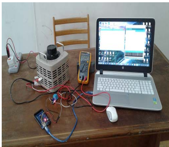
Figure-6. The experimental setup.

From the results obtained, both the instantaneous and peak voltage methods indicated that the 3 rd order polynomial is the best among the five equations in representing the sensor response. The errors are much less in the peak voltage method even though it gives a huge error when there is spike in the supply which occur very rarely. The instantaneous voltage method has higher errors in the measurement though it is much needed in calculating the power consumption of the system.