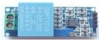
Figure-1. ZMPT101B voltage sensor module.

ZMPT101B voltage sensor module is a voltage sensor made from the ZMPT101B voltage transformer. It has high accuracy, good consistency for voltage and power measurement and it can measure up to 250V AC. It is simple to use and comes with a multi turn trim potentiometer for adjusting the ADC output. The analysis in this paper tends to find more accurate relationship between the input voltage and the ADC output by regression analysis. The ADC output is adjusted using the trimpot to an appropriate value against a reference input. Figure-1 is the ZMPT101B voltage sensor module.