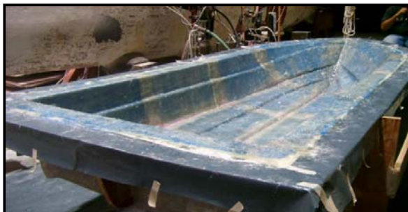
Figure-1. Mould for the experimental setup.

This experiment has been divided into two phases: (1) to conduct the selected mechanical test of conventional hand laminating composite boat, and (2) to conduct the selected mechanical test of resin infusion composite boat. The experiment was conducted for 12-feet fishing boat as shown in Figure-1. Same mould has been used for both techniques; hand laminating and resin infusion. The experiment was conducted in controlled environment.