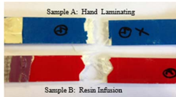
Figure-3. Fracture specimens of composite fabricated using 2 different methods.

was noted that the product by hand laminating produced almost double the thickness of resin infusion.