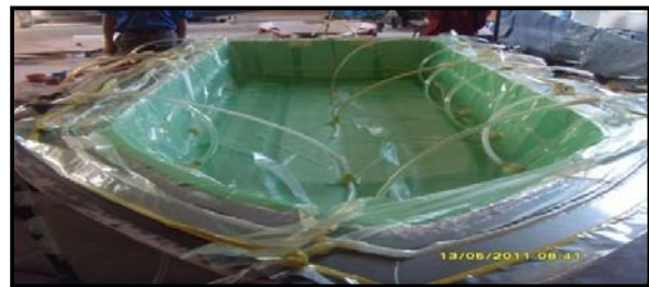
Figure-2. Resin infusion setup.

The general setup of resin infusion using the same principle of vacuum pressure was used to drive resin into a laminated layer of fiber mat. The same basic setup has been described in [12-15]. The setup is shown in Figure-2 below.