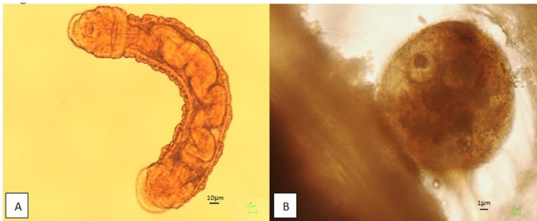
Figure 3: A=3rd Maxilipede infestation by Branchiobdella kozarovi (100X), B=Peleopods infestation by cocoons of Branchiobdella kozarovi (1000X)

The numerous cocoons were attached on the thorax segments (exopodit, protopodit, epipodit) of crayfishes (Figure 3). High infestation in the presence of branchiobdellidan and their cocoons were observed in the exoskeletons of samples during spring and summer (100%). Metazoan ectosymbionts included: Aeolosoma hemprichi (Annelida), Philodina acuticornis (Rotatoria), Mesocyclops strennus of copepods, and