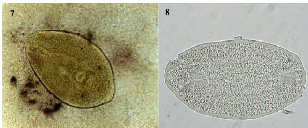
Figure 7: Metacercaria of Diplostomum spathaceum (194 X)