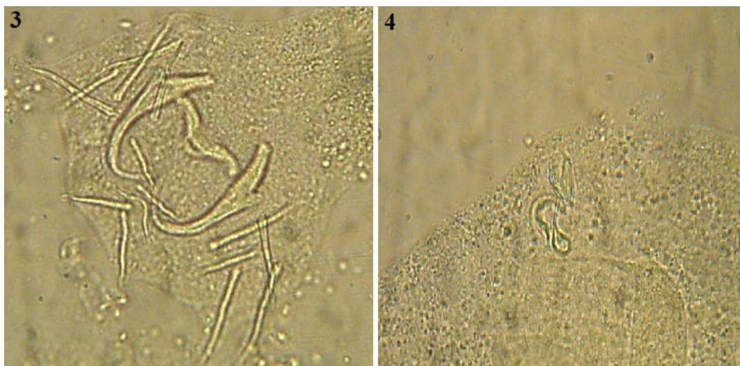
Figure 3: Anchors of Dactylogyrus lenkorani (X 298)