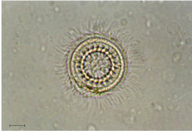
Figure 3: T. reticulata (X746), scale bar 10 \mu\text{m}