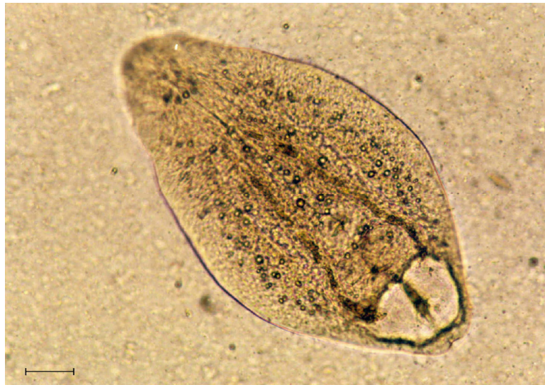
Figure 4: D. spathaceum (X373), scale bar 50 \mu\text{m}