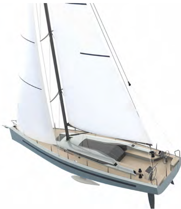
The Neptune 60 project is not your average performance cruiser. This 60 foot sailing monster is a full carbon built racer with all the latest technologies and performance features the market has to offer.