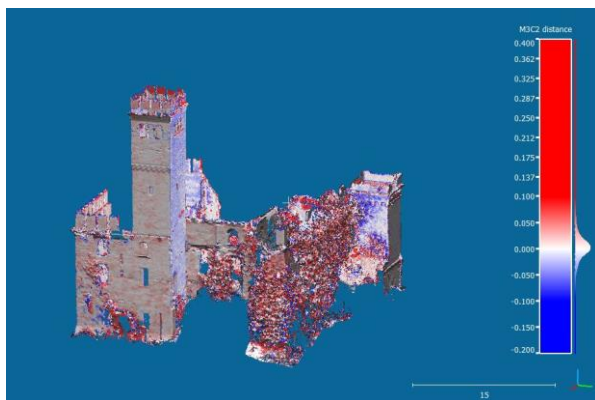
Figure 5. Distances (in meters) between the photogrammetric dense cloud (N+O+T case) and the reference TLS point cloud, computed using the M3C2 algorithm for the entire castle.

The first consideration that emerges from the statistics shown in Table 3 is that the best results can be obtained using an homogenous dataset, in terms of geometry acquisition. The introduction of nadiral and terrestrial images implicates more redundancy, resulting in more noisy dense clouds. During the photogrammetric processing, a single camera self-calibration was performed, meaning that the acquisition conditions were assumed fixed among the different surveys. Considering different block constrains, it is quite evident that the 19 and 3 GCPs solutions are characterized by the same level of errors, while the RMS increased for the 12 GCPs case. These results confirmed the ones previously discussed about the quality of the photogrammetric solutions (see Table 1). The above-mentioned worsening could be mainly ascribed to the bad quality of the GCPs distribution in the last case. The accuracy obtained using the minimum constrain solution (3 GCPs) are comparable with the one that characterize the 19 GCPs case, meaning that in case of emergencies could be sufficient to use a low number of well distributed GCPs, for a preliminary quick solution. However, it is recommended to use at least few more GPSs to allow the identification of possible outliers.