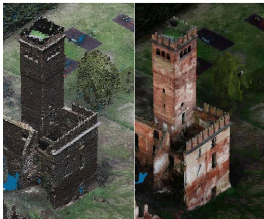
Figure 4. An example of photogrammetric dense point cloud (left) and the correspondent textured meshed model (right).

With the aim to evaluate the spacing of the generated point clouds, the mean distance between each point and the corresponding nearest neighbor was computed. The average distance between points was equal to 0.025 m, with a standard deviation of 0.012 m. For the oblique image case, the point cloud has been created also using a high density, resulting in a thicker spacing (0.018 m with a standard deviation of 0.009).