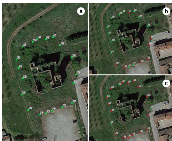
Figure 3. Locations of the GCPs and CPs over the surveyed area. GCPs are represented by green dots, while CPs by red dots. a) 19 GCPs case b) 12 GCPs case c) 3 GCPs case.

photogrammetric block (O) has been processed separately. The solution composed only by images acquired during the nadiral flights was not created, because of the absence of images in correspondence of the perimeter walls, which would have resulted in an incomplete model. The combination of nadiral and terrestrial images (N+T) was discarded because the software was unable to orient the two dataset together. This behaviour is due to the limited overlapping among the nadiral images and the ones acquired from the ground. In fact, the former captured the castle from the top view, while the latter corresponded to the perimeters walls. Three different GCPs constraints have been considered for each of the already introduced block geometry. In particular, in the first scenario the whole set of 19 GCPs have been used. In the second case, only 12 GCPs have been used, and the remaining 7 points have been exploited as Check Points (CPs). Here, the GCPs have been selected with the aim to evaluate the worst possible scenario, such as the presence of heaps of rubble, which prevents to homogeneously distribute them. In the last scenario, the minimum number of GPCs requested for orienting a photogrammetric block (3) has been used, therefore the other 16 points have been considered as CPs. The distribution of GCPs and CPs is shown in Figure 3.