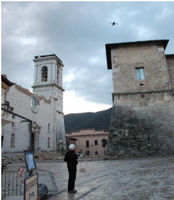
Figure 7. Photogrammetric survey with UAS.

The photogrammetric survey has been processed using the commercial software Agisoft Photoscan (version 1.2.6) to produce dense clouds, which were used to retrieve measures and geometrical information about the various structural elements of the Tower and the Co-cathedral. Therefore, it was possible to plan the provisional reinforcement systems, which were installed the day after the delivering of dense point clouds (i.e. the day after the survey itself). In this case, also 3D textured models and orthophotos of the horizontal and vertical planes have been realized to create a proper documentation, useful for the preservation of cultural and historical heritage. Moreover, the 3D model can be used for further studies such as the analyses of structures in response to other earthquakes. These 3D models can accurately describe the constructions with an appropriate level of detail for Finite Element Method (FEM) for structural analysis.