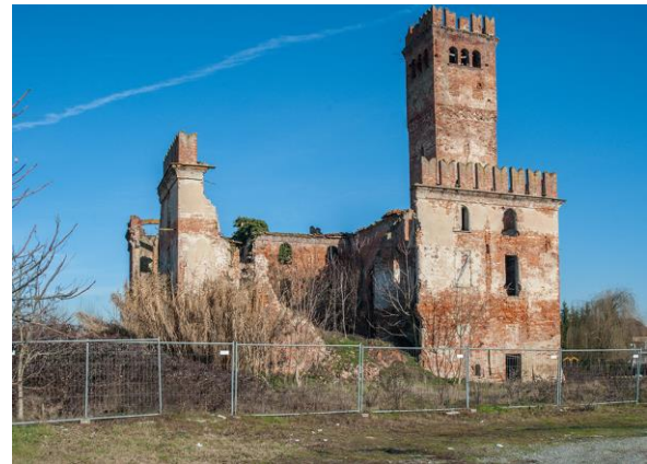
Figure 1. Castle of Casalbagliano.

structure is in poor conditions, with an effective risk of collapse. One of the reasons that brought the structure to the current state is the flood of Tanaro River, which affected Alessandria in 1994. Before the realization of the survey, a site inspection has been carried out, with the aim to define the optimal location of the station points used for the determination of the geodetic network and for the TLS acquisitions. The station points were chosen paying particular attention to guarantee their inter-visibility. Moreover, possible obstacles that could interfere with the UAS flight and with the Global Navigation Satellite System (GNSS) survey were observed and taken into account for the planning of the survey itself.