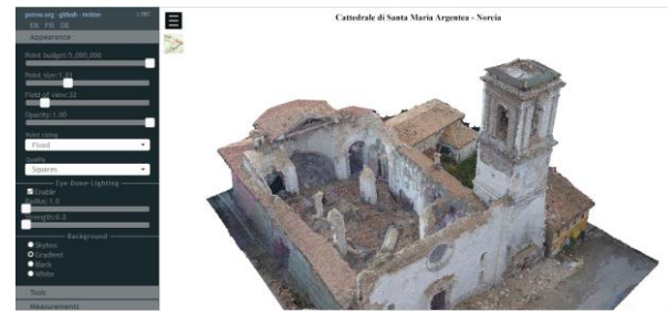
Figure 8. Point cloud of the Co-cathedral of Santa Maria Argentea deriving from photogrammetric UAS survey.

This and other later experiences gained in the context of emergencies survey (which will be object of dedicated works) have demonstrated the proper way of operating and processing, with the reliability of the obtained results at the service of structural engineering.