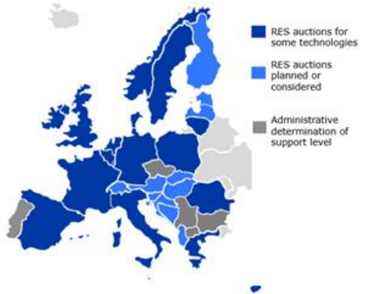
Figure 1: Use of RES auctions in Europe (Ecofys 2017)

Auctions for renewable energy (RES) support are market-based, competitive bidding processes to identify the most appropriate RES projects to be constructed within a certain time frame and geographical area and to allocate appropriate support payments to these projects. A RES auction is a procurement auction, where typically a certain amount of power (MW) or energy (MWh) of renewables are offered up for bidding. Bidders compete to be allowed to deliver these volumes on basis of their required support level (often a premium in EUR/MWh). The projects with the lowest required support levels typically win the auction. Winners are then granted the right to construct their RES projects and the right to receive support payments for these projects for a given period of time.