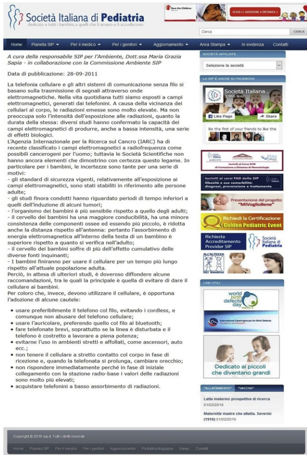
Fig. 1 Screenshot of one of the websites used. (Figure 1 should not appear here. The right place is in the Method section (see where I included the citation to this figure).)