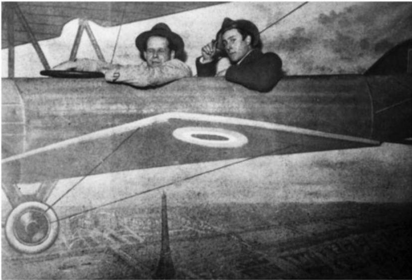
Sergei Eisenstein and Jean Painlevé in Paris, 1930.

Painlevé also took Eisenstein on a grand tour of Paris, to the Palais Royal square and to the Comédie-Française. Of this tour, Painlevé would later recall: 'I also took him to the Cigale theatre to see an exceptional American film Red Christmas . Afterward, we wandered around the Clichy fairgrounds ... and had our photo taken in a mock airplane.' 23