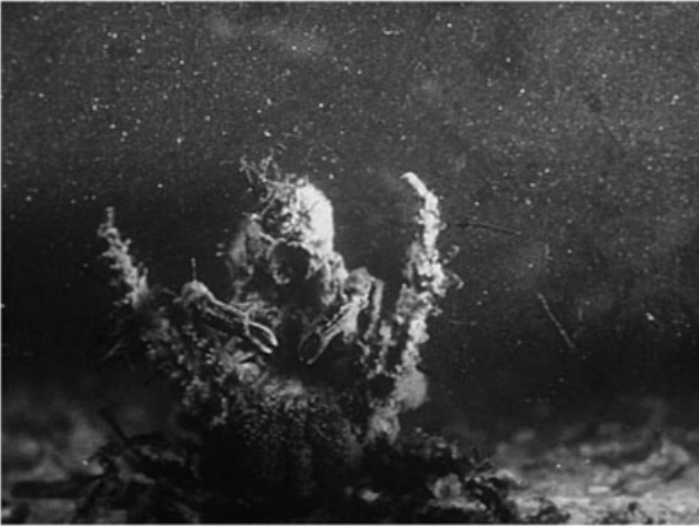
Still from Jean Painlevé, Hyas et Sténorinques , 1928, 35 mm, N/B, 9mn.

In conclusion, there are strong indications that Painlevé's documentary films influenced, if not directly inspired, Eisenstein's idea of protoplasmaticity, understood as a continuing metamorphosis and montage of all forms, from the most basic to the most complex, from unicellular organisms to man. As Oksana Bulgakowa points out in the afterword to Eisenstein's notes on Disney: 'He [Eisenstein] saw the grounds of Disney's effect in the (utopian) promise of freedom from ossified form, which allows for a state of eternal flux and becoming, and a freedom in the relationship between man and nature. [...] Art could thus be considered an anthropological necessity.' 37