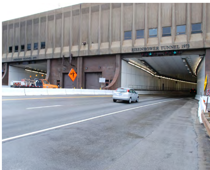
Figure 1.3 Eisenhower/Johnson Memorial Tunnel on I-70 in Colorado

The RCT on westbound I-70 at milepost 127 in Glenwood Canyon is a short, two-lane, single-bore tunnel through rock outcropping. The tunnel gets its name from a double curve in the Colorado River at that location.