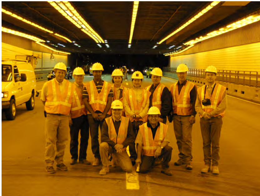
Figure 1.8 Scan team members in Central Artery Tunnel during MassDOT overnight maintenance closure

The nine member scan team consisted of two representatives from FHWA, five representatives from state DOTs, an academic member representing the TRB's AFF60, and the report facilitator (see Figure 1.8). Contact information and biographical sketches are given in Appendix F and Appendix G, respectively.