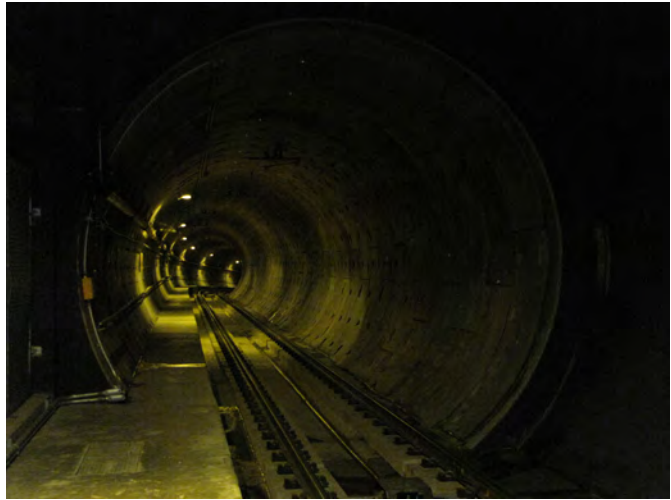
Figure 1.7B Sound Transit Tunnel