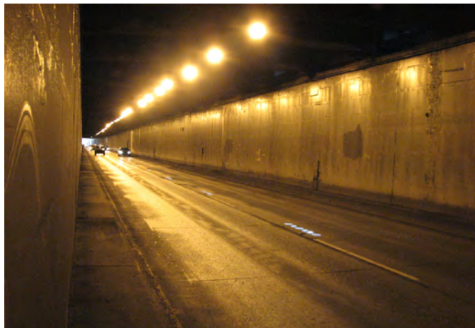
Figure 1.6A One bore of Battery Street Tunnel

The Seattle DOT hosted the scan team on a tour of the Battery Street Tunnel on SR 99 in Seattle (see Figure 1.6) 22 . Built in 1952, the tunnel is owned by Washington State and maintained by the Seattle DOT. It is 3,140 feet long and consists of two bores with two lanes in each direction. The tunnel is equipped with ventilation, drainage, and fire suppression systems.