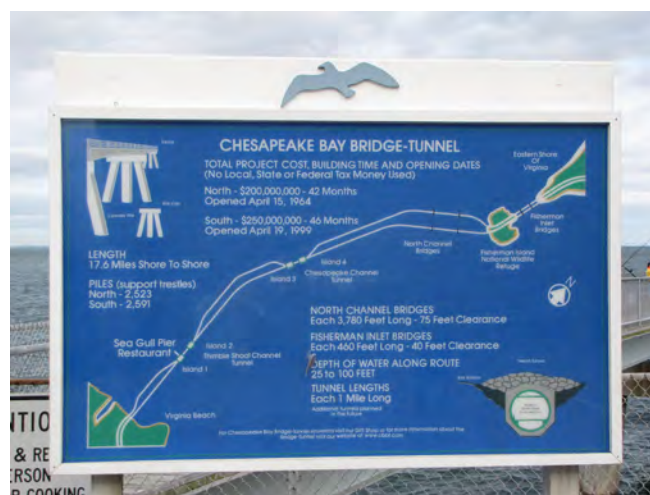
Figure 1.4 Chesapeake Bay Bridge-Tunnel

The Chesapeake Bay Bridge and Tunnel (CBBT) District owns and operates the CBBT, which opened in 1964 16 . The CBBT consists of over 12 miles of low level trestle, two one-mile bi-directional tunnels, two bridges, almost 2 miles of causeway, and four manmade islands, totaling 17.6 miles from shore to shore plus 5.5 miles of approach roads as shown in Figure 1.4. It connects Southeastern Virginia and the Delmarva Peninsula (Delaware and the Eastern Shore