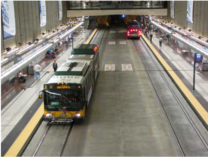
Figure 1.7A Downtown Seattle transit station