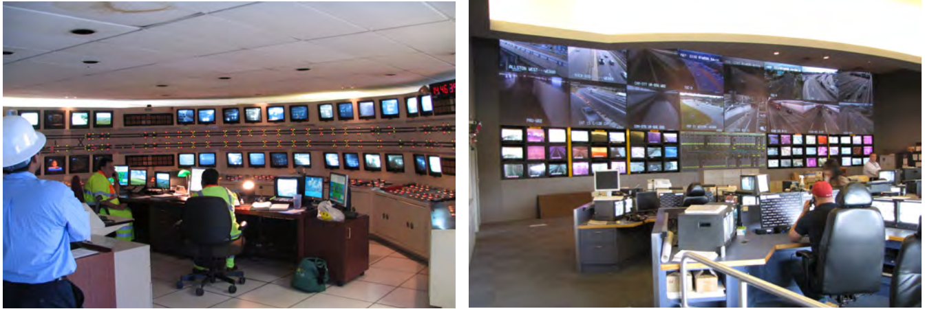
Figure 2.2 Integrated operations control centers

AKDOT&PF: Only the operations system and traffic control are integrated. The support systems send signals that they are functioning or not, but they cannot be controlled from the operations panel. The fan monitoring system is standalone.