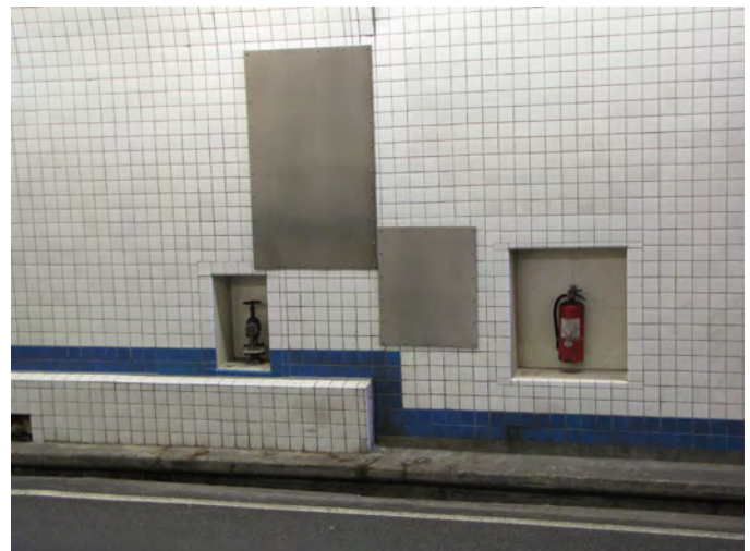
Figure 2.3 Fire safety equipment in a highway tunnel in 2009

The HLT trains its staff to respond to and extinguish a car fire in six minutes or less. All traffic in both directions is stopped outside the portals, and any traveling public stopped in the tunnels are instructed to evacuate the bore on foot through cross-passages to the other bore. This is