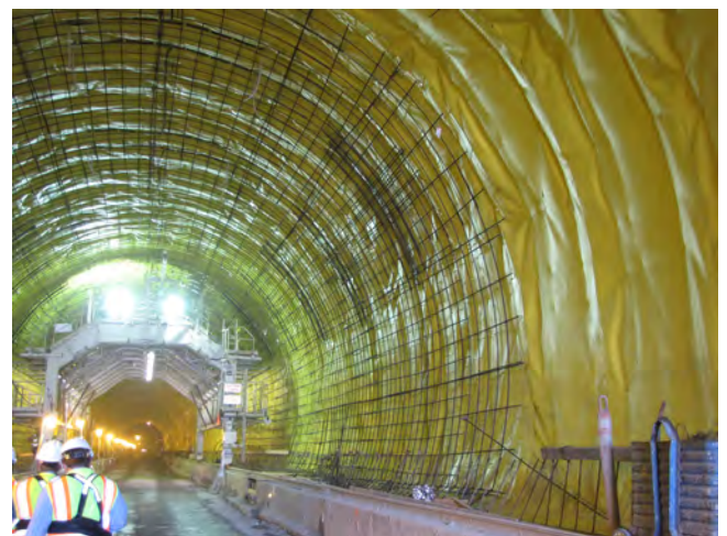
Figure 1.2 Devil's Slide Tunnel under construction on Route 1 near San Francisco