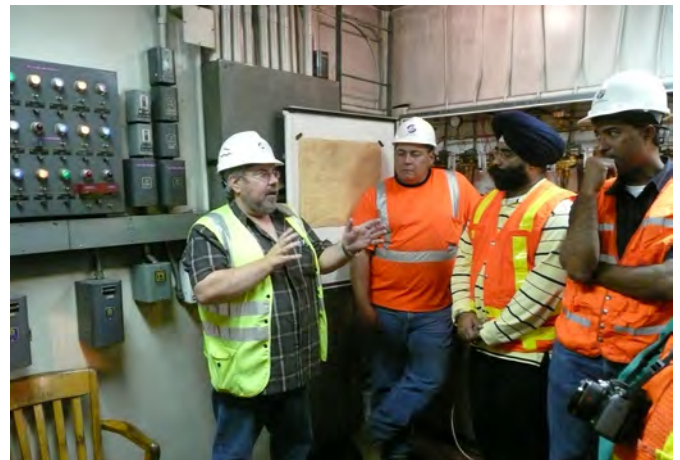
Figure 1.6B Battery Street Tunnel control room

The Seattle Fire Department gave the scan team a presentation on the tunnel's history; risk factors; design fire; tunnel regulations; NFPA standards; and tunnel fire and life-safety systems, which include detection, notification, ventilation exiting the tunnel, and fire suppression.