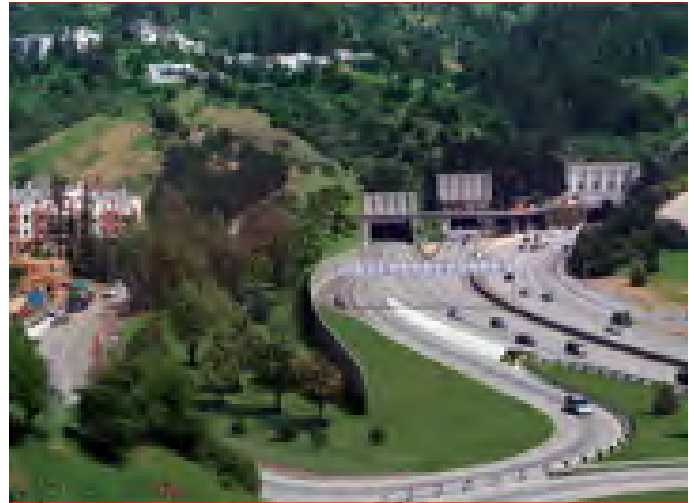
Figure 1.1 Fourth two-lane Caldecott Tunnel bore on SR-24 under construction

The EJMT is a twin-bore tunnel 60 miles west of Denver 11 . The westbound bore opened to two-way traffic in 1973. Once the eastbound bore opened in 1979, each bore then carried one way traffic. At 11,000 feet, the 1.7-mile tunnel is the highest elevation for a vehicular tunnel in the world. The tunnels are approximately 115 feet apart at the east entrance and 120 feet apart at the west entrance. The exhaust ducts and air supply ducts are located above a suspended porcelain enamel panel ceiling. A