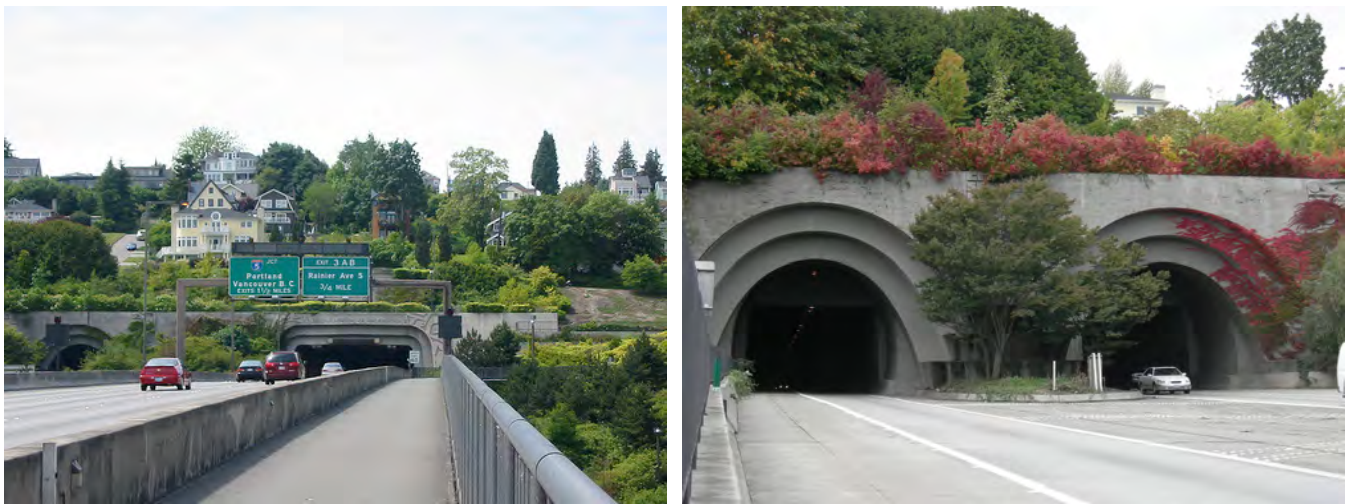
Figure 1.5 Mount Baker Ridge Tunnel on I-90 in Seattle

Built in 1940 and rehabilitated in 1993, the WSDOT's twin-bore Mount Baker Ridge Tunnel (see Figure 1.5) 19 carries I-90 under Seattle's Mount Baker neighborhood to Lake Washington (see Figure 1.5) 20 . Listed on the National Register of Historic Places, the three parallel tunnels carry eight traffic lanes as well as bicyclists and pedestrians. Bored through clay, it is the world's largest diameter soft earth tunnel.