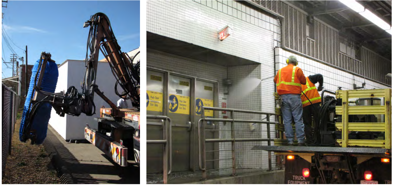
Figure 2.1 Examples of equipment used to wash tunnel walls

Caltrans: Caltrans does not have a predetermined wash schedule. Washing is done on an as needed basis, on demand, or as a result of complaints.