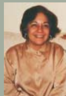
Prof Dr. Maya Khemlani David

code switching occurs and the functions of the different languages used by a speaker was another area of research. In language choices and code switching in service encounters in Kuala Lumpur it was found that both the buyer and seller constantly accommodated each others language choice yet in other studies conducted in Tunisia only the seller accommodated (see David, 1999). Most studies on code switching argue that phenomena manifests in informal settings yet in a formal setting, Malaysian court rooms it was found that strategically motivated reasons triggered code switching (David, 2003a). Malaysian colleagues were invited to examine code switching in other settings (see Zuraidah, 2003 on code switching among Kelantanese; Kow 2003 on code switching among children and Jariah 2003 on code switching as a strategic power tool in a government department) These appeared in a guest edited issue of Multilingua entitled Code Switching in Malaysia (David, 2003).