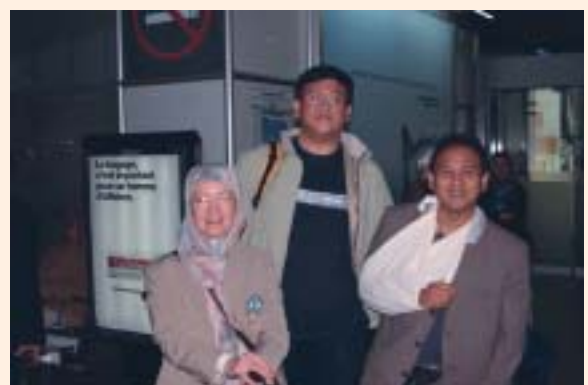
Two doctors and the patient