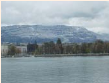
The View across Lake Geneva