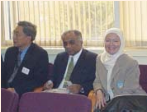
A Big Smile