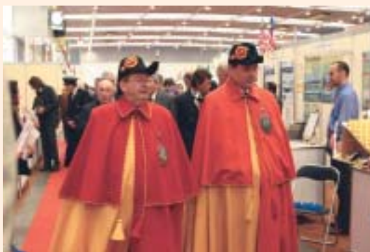
".....here comes the Mayor....."