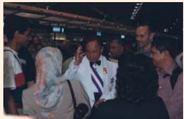
The Big Send-Off