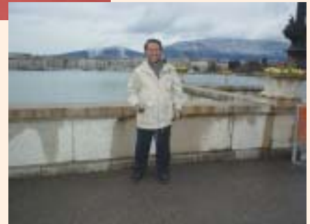
The "Tour" Manager