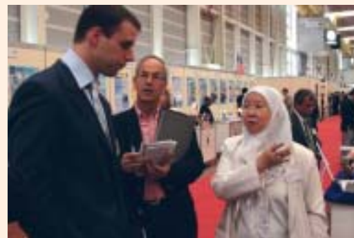
".....my invention is....."