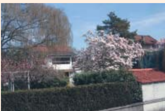
Spring time in Geneva