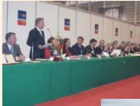
"And the winners are....."