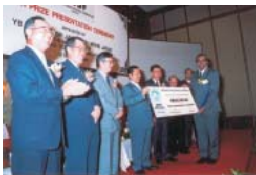
MTSF's 11 th Prize Presentation Ceremony, 2004

He serves as Honorary Secretary to the Malaysian Institute of Physics. He also serves as an Associate Editor of the Jurnal Fizik Malaysia as well as of the Malaysian Journal of Science Part B: Physical Sciences.