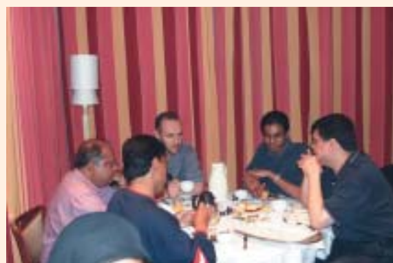
This is our strategy