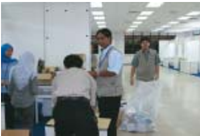
The boys hard at work before the big day