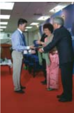
One of the winners proudly receiving his award