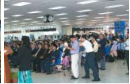
The opening ceremony attracted many reporters from local premier newspapers