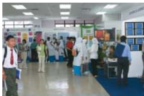
The expo attracted many school students