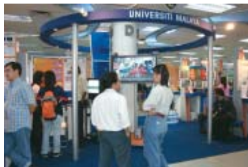
The Main Gallery