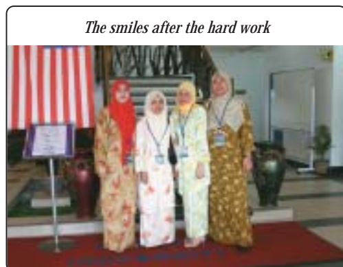
The smiles after the hard work