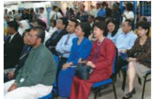
The crowd at the opening ceremony