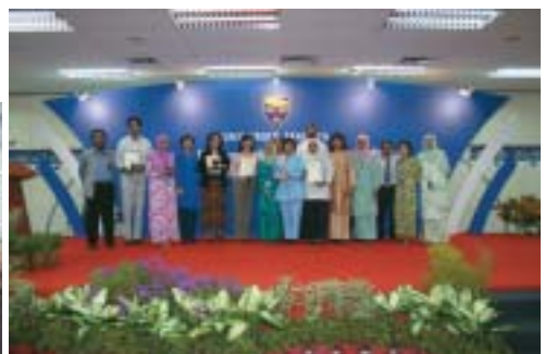
Some of the winners showcasing their awards