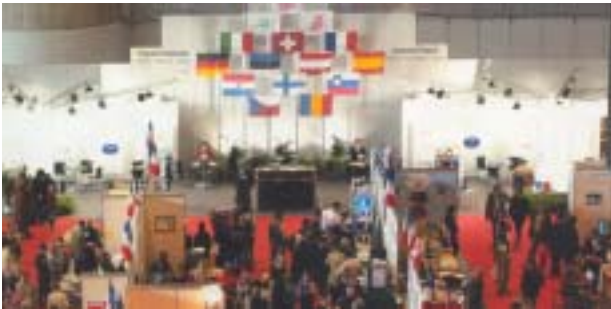
The 2003 exhibition