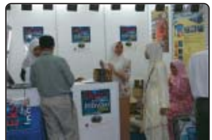
Busy entertaining visitors during the first day