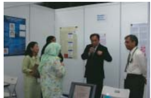
The Vice-Chancellor visiting one of the booths