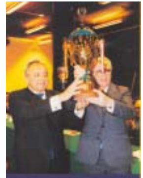
The overall winner from Russia in the 2003 Geneva exhibition