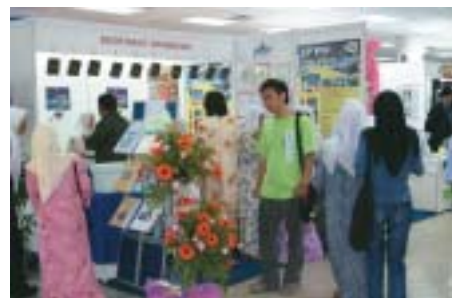
The secretariat booth