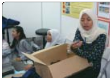
Time for a break