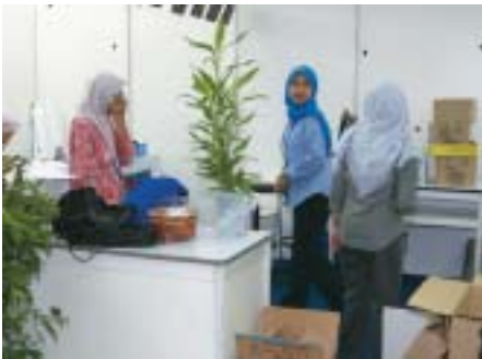
The girls busy finalizing their preparation before the big day