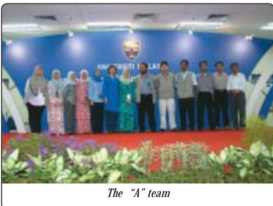
The "A" team