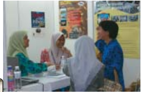
IPPP Deputy Director (in green) and IPPP KPP (in blue)... Two of the most important persons in organizing this exhibition