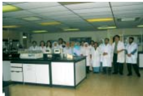
THE COMBICAT TEAM