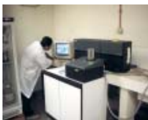
Particle Size Analyser