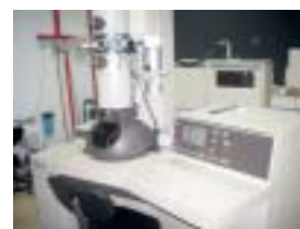
Transmission Electron Microscope