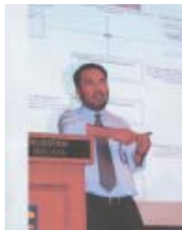
Any problem with e-irpa, I'm the man to see

The series of IRPA Talks and Workshops rolled off to a good start with the one held by the Faculty of Engineering from 18 – 20 June 2004. This session was held in the greenery and cold ambience of Awana Golf and Country Resort in Genting Highlands, which was very conducive for encouraging interest and motivation. The Faculty of Engineering through its own effort managed to attract many of their researchers. The objective of this workshop was attained as 20 IRPA proposals were submitted to the Director of IPPP at the end of the workshop.