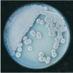
Actinomycetes that lives in the coral reef sponges

The research was funded by a short-term research grant from the University of Malaya and is currently being funded by the Malaysia Toray Science Foundation (MTSF) Science & Technology Research Grant.