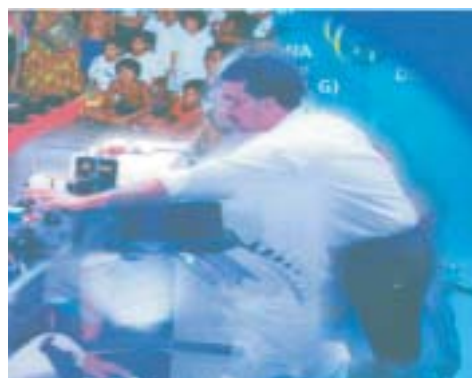
THE PLANAR WAVEGUIDE PROJECT