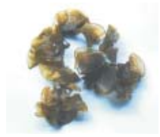
The marine organisms collected for the research. From the left are: the soft coral, marine sponges and seaweeds