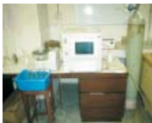
Total Organic Carbon Analyser