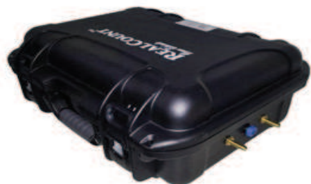
Figure 1: RealCount™ Automated Traffic Classifier console

Traffic data is important in transport planning, traffic impact assessment, any planning and design of transport facilities and road networks. It is a compulsory input for carrying out traffic impact studies for any new land use development such as residential, commercial, mixed development areas and townships. This opens the door for invention of an accurate and comprehensive traffic data tool. The invention called The RealCount™ Automated Traffic Classifier (RealCount™ ATC) (Figure 1). It is the only automated traffic classifier that can provide individual vehicular data and traffic without any estimation. The system is also capable of isolating each vehicle within a traffic platoon and can classify the vehicles according to number of axles and wheelbase. It is classified under intrusive multiple technology as the detectors and road sensors are installed on the road using a special road tape with minimum to no damage to the road (Figure 2). As many other research projects, the invention underwent many challenges from preliminary design, hardware and software development and improvement, functional testing and product enhancement for commercial purposes.