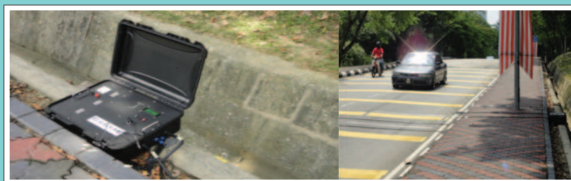
Figure 2: RealCount™ ATC installed on the road

Traffic data is important in transport planning, traffic impact assessment, any planning and design of transport facilities and road networks. It is a compulsory input for carrying out traffic impact studies for any new land use development such as residential, commercial, mixed development areas and townships. This opens the door for invention of an accurate and comprehensive traffic data tool. The invention called The RealCount™ Automated Traffic Classifier (RealCount™ ATC) (Figure 1). It is the only automated traffic classifier that can provide individual vehicular data and traffic without any estimation. The system is also capable of isolating each vehicle within a traffic platoon and can classify the vehicles according to number of axles and wheelbase. It is classified under intrusive multiple technology as the detectors and road sensors are installed on the road using a special road tape with minimum to no damage to the road (Figure 2). As many other research projects, the invention underwent many challenges from preliminary design, hardware and software development and improvement, functional testing and product enhancement for commercial purposes.