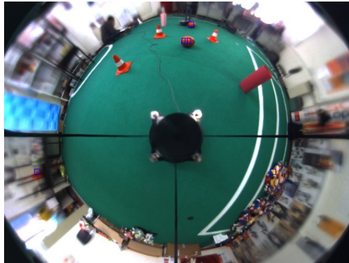
Figure 5: Ball reliably classified (blue square) after an insertion of new elements

ball color. An input sample containing the road cone may generate an ANN's output as [-1 \ 1 \ -1] rather than [-1 \ -1 \ 1] as expected, once it has to be classified as "other elements". A tolerance value, which is the difference between the desired output and the current ANN's output, was used to solve this misclassification. Several experiments demonstrated an ideal tolerance value of 0.3. Figure 6 shows a tolerance value of 0.5 in order to show a misclassification between ball and road cone.