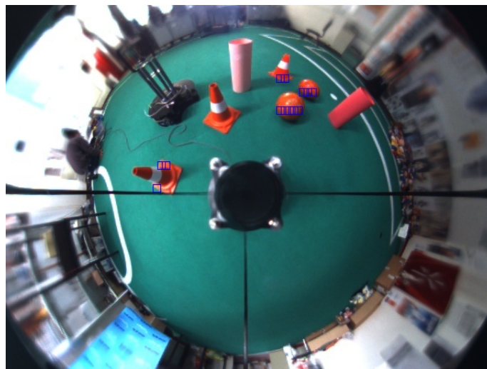
Figure 6: Example of misclassification between ball and road cone.

Two short movies were recorded to show the software working on a real environment, the first video shows the classification of some parts of the image 1 whereas the second one shows the classification for the whole image 2 .