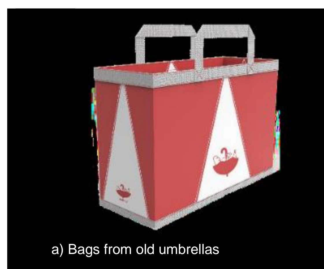
a) Bags from old umbrellas