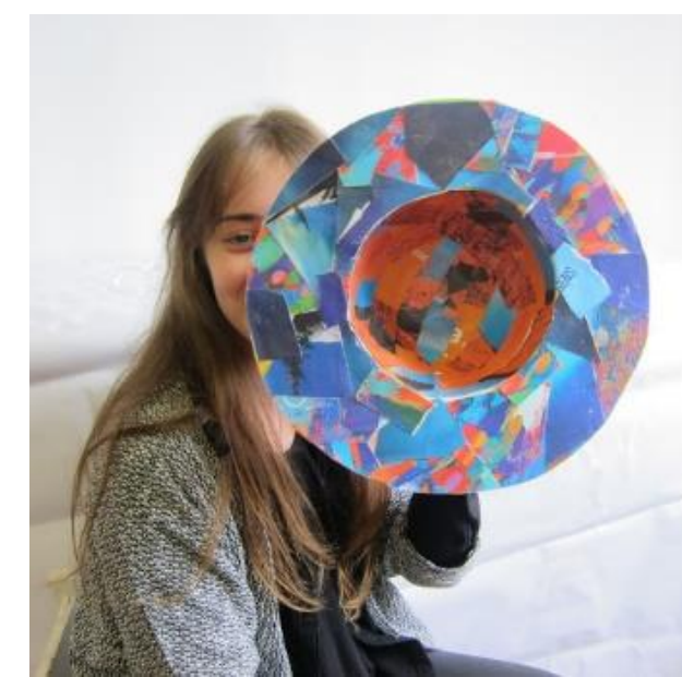
c) hat for girls