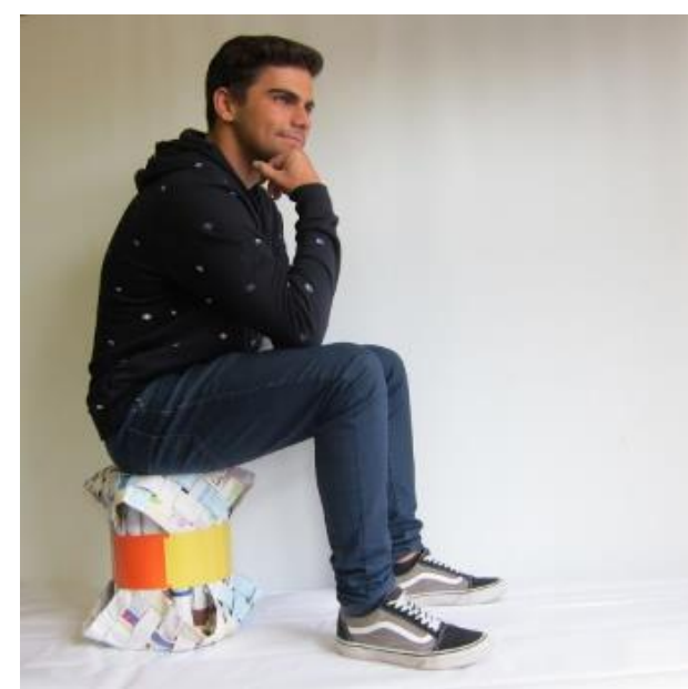
b) school bench