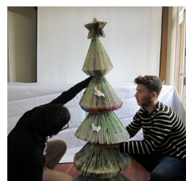
a) Christmas tree

For the first time in 2017, two undergraduate Design students did their curricular traineeship at the CVR (Center for the Valorization of Waste, University of Minho). This fact was the motto to think and organize some questions about how this theme is approached throughout the course. Thinking on how to organize those examples, we reached three categories of products and processes related to Design for sustainability. (In some cases, these characteristics are combined). We call them: (Eco) Design Show, Re-new (Design) and (New) Design.