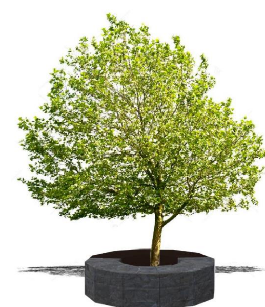
a) Modular bench of lime mortars and geopolymers