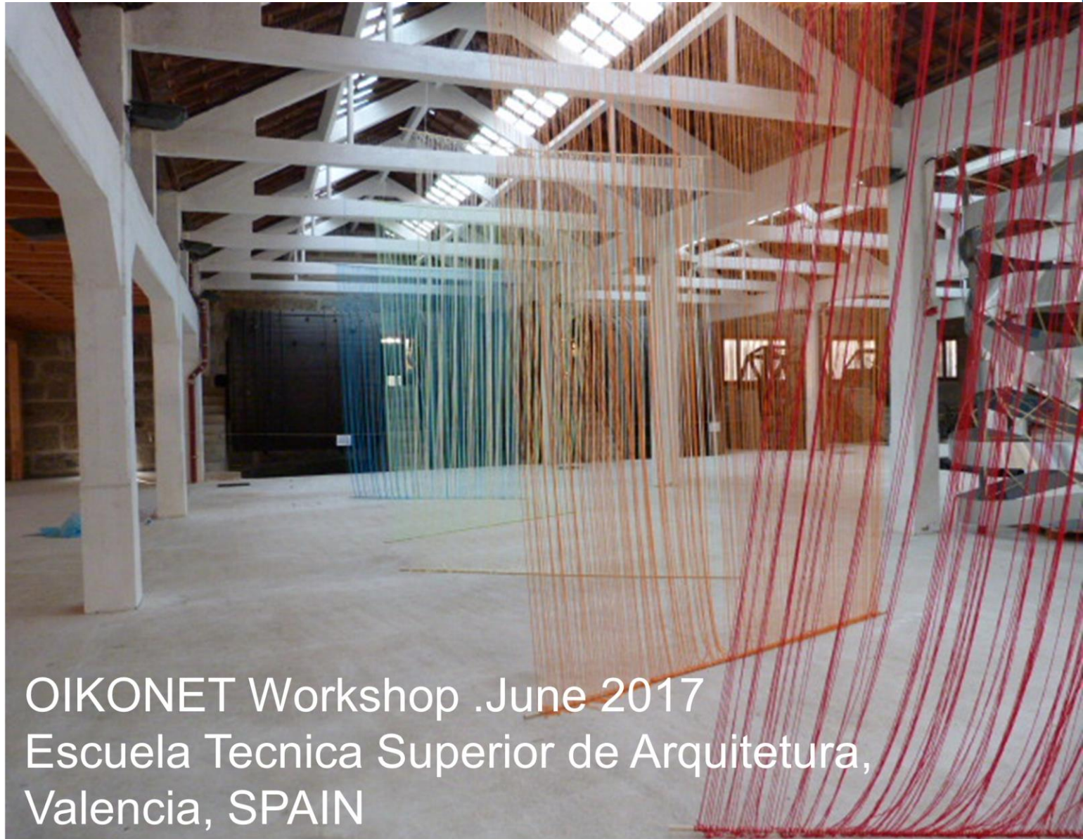
OIKONET Workshop .June 2017 Escuela Tecnica Superior de Arquitectura, Valencia, SPAIN