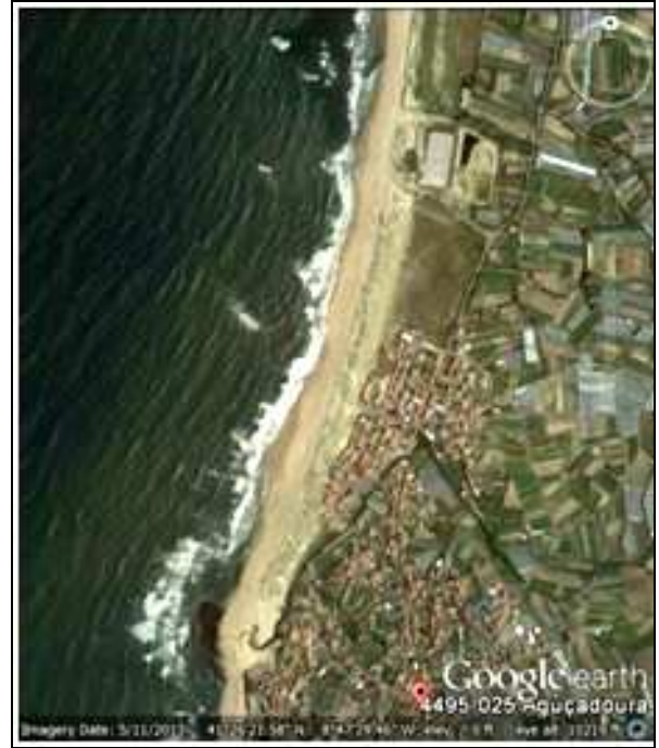
Figure 2. Aguçadoura beach.

The Aguçadoura and Ramalha beaches are the famous tourist destinations. located in the city's rural outskirts, Aguçadoura is the best surfing beach of the city of Póvoa de Varzim, with a large dune area, making it the longest beach in Póvoa [8]. Ramalha beach also displays a very extensive sand and well preserved dune system [9].