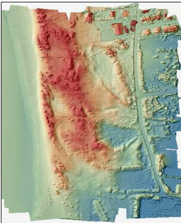
Figure 8. DEM of Ramalha beach (2014).

At this stage of study, we derived the above product without using the ground control points, or we used only the camera GPS data. For the case of Aguçadoura the accuracy of the altitude or the z-value is 2.8 meters in average and that of the pixel is 0.6 in average (Figure 10). We visualized the models in the GISs software and checked the relief heights there. The same accuracies had the Ramalha beach models.