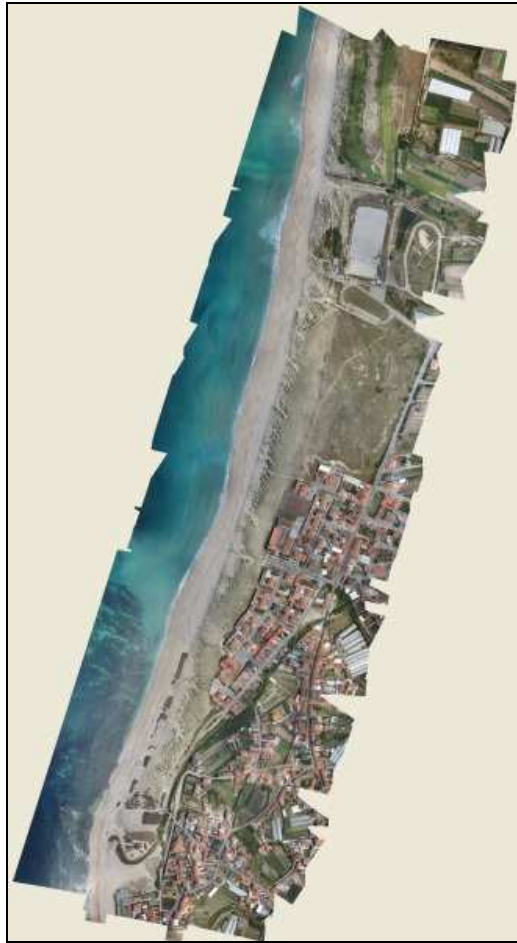
Figure 7. Orthophoto of the Aguçadoura beach (2014).