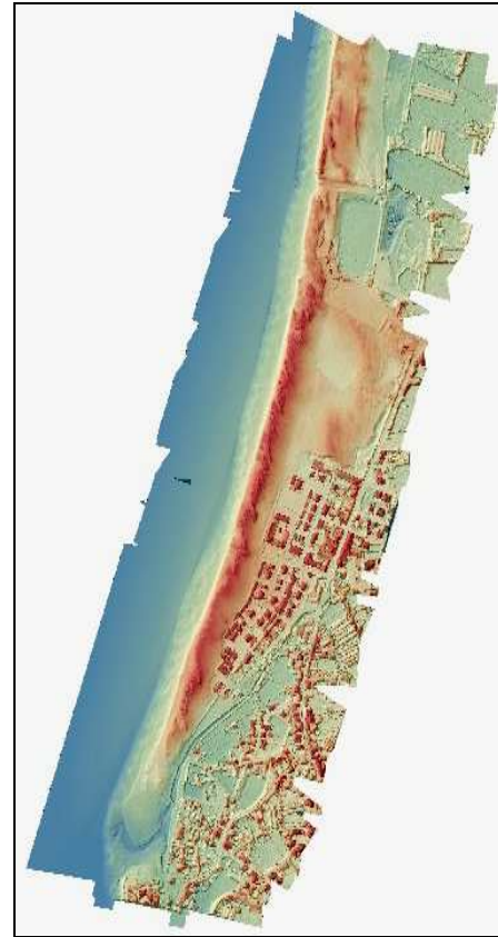
Figure 9. DEM of Aguçadoura beach (2014).