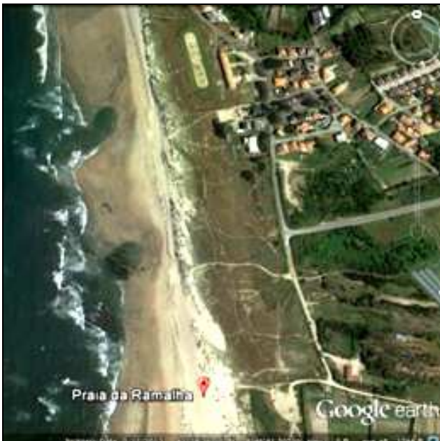
Figure 1. Ramalia beach (Source: Google Earth Pro image, 2013).

The coastal zone of northwest Portugal can be subdivided into two geomorphological sectors: Sector 1, between the Minho River and the town of Espinho, where the coastal segments consist of estuaries, sandy and shingle beaches with rocky outcrops, and Holocene dune systems (foredunes and some migrating dunes with blow-outs). The estuaries and the foredunes in particular are very degraded by human activities. Sector 2, between Espinho and the Mondego Cape, where coastal lagoons and Holocene dune systems (foredunes, parabolic and transverse dunes) occur [7]. We chose the two beaches for surveying – Aguçadoura and Ramalha beaches, which fall into the Sector 1 (Figure 1, Figure 2).