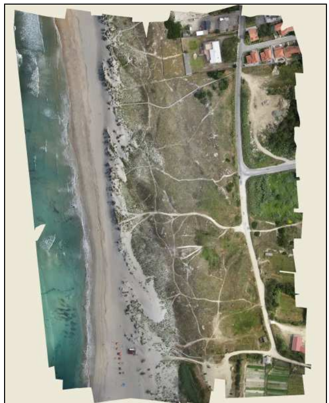
Figure 6. Orthophoto of the Ramalha beach (2014).

According to the complete workflow of the Agisoft PhotoScan Professional we generated the 2D georeferenced orthophotos and 3D digital elevation models of Aguçadoura and Ramalha beaches (Fig. 6, 7, 8, 9).