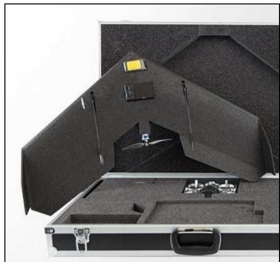
Figure 3. The swinglet CAM with the camera Canon Ixus 220 HS onboard.

We conducted several field works. Goals of our field works were to study the present geoeological conditions of the Portuguese north-west coastal zone by using the traditional surveying methods and by applying the latest research method of close-range digital photogrammetry.