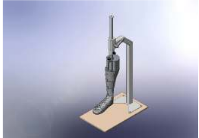
FIGURE 1 FINAL FOOT ASSEMBLY WITH THE SEVEN ALUMINIUM SEGMENTS.

The foot manikin was based in a model-shaped foot and built according anthropometric dimensions, after which it was submitted to a 3D scanning digitalization using the 3D Laser ZScanner®, from DeltaCAD. The resulting file was then converted into a *.stl file type for a final SolidWorks® processing stage. After this stage, all seven segments were manufactured in a CNC machine using an aluminium alloy (Fig. 1).