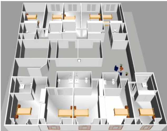
Fig. 3 Creating the virtual world from the blueprint

Pictures of the surrounding area, as seen through the windows of the building, were used to make the environment more realistic. Figure 4 shows, side by side, an actual room from the house and its virtual counterpart. The virtual environment required two person days of effort once the blueprint and photographs were available.