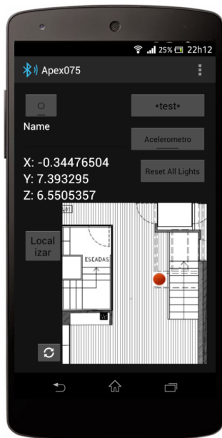
Fig. 5 The Android app showing an alarm's location

proposal was to use the WiFi signal for estimating a resident's location. At this stage the focus was in understanding the users' reaction to the functionality, rather than exploring its implementation