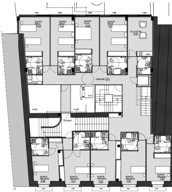
Fig. 2 Second floor blueprint