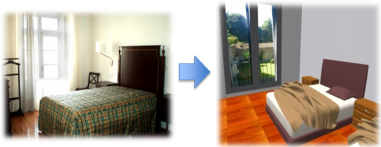
Fig. 4 A physical and corresponding virtual bedroom