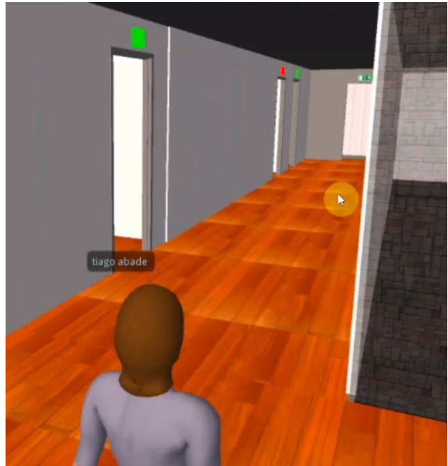
Fig. 7 Presence lights

Group members were all in the 70+ age group. They expressed no knowledge or understanding of smart houses or ambient assisted living. When the virtual environment was presented it was possible to observe that residents identified the environment with the house. They were able to identify which rooms belonged to whom. The fact that the group were immersed in the environment in a visceral way was particularly evident when