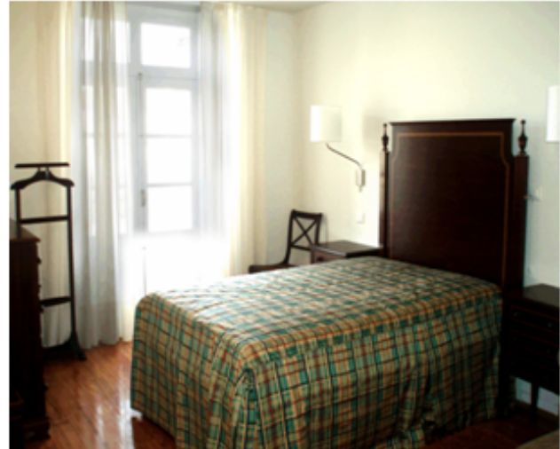
Fig. 1 Care home at Braga

not possible for example to log those who enter or leave the building.