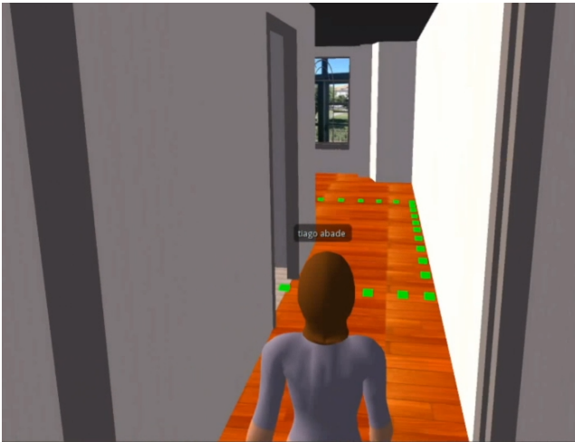
Fig. 6 Guidance lights

was controlled by one of the team members while a second member recorded the discussion. This provided a setting similar to that of watching a play or movie on TV, something the members of the focus group would be accustomed to. The idea was that the presentation of a group of scenarios would be used as a baseline with the possibility of changing the trajectory of any of the scenarios in response to user feedback. The team member who was controlling the prototype asked questions and promoted discussion within the focus group.