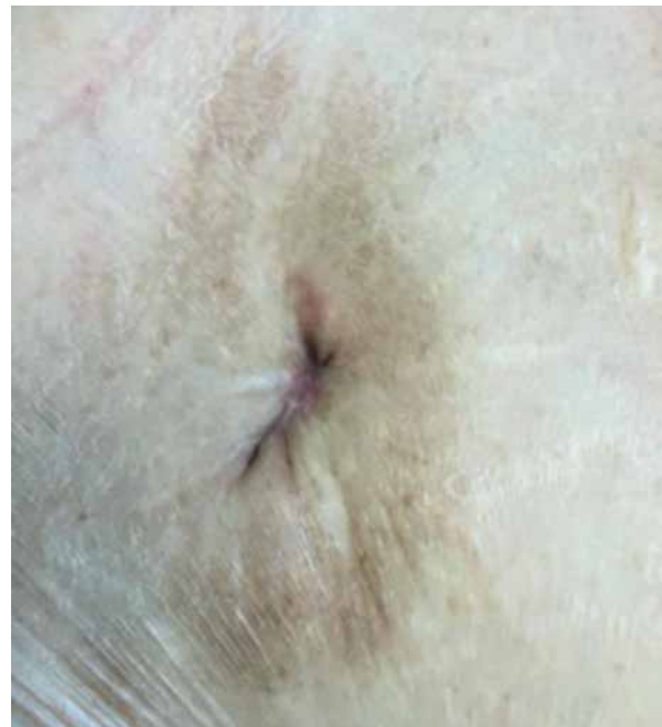
Photo 4. Surgical wound after 6 months

An enterocutaneous fistula is still one of the most complex and challenging complications in surgical practice [4–7]. In the literature an overall spontaneous closure rate of 7–70% is reported [8, 9]. The optimal timing for a definite surgical treatment is at least 6 months after the last laparotomy or any sign of intra-abdominal infection [4]. Not all patients are able to overcome complex surgery. Minimally invasive approaches have arisen as an alternative way for these patients, with less morbidity and faster