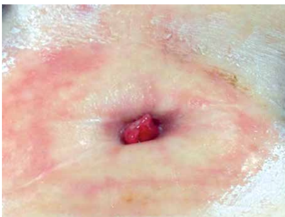
Photo 1. Outer orifice in the right lower quadrant of the abdomen

The next goal was the destruction of the fistula from the inside with cleansing of the fistula tract and finally closure of the internal and external openings. First, we removed the obturator and replaced it with the electrode, which destroyed the fistula tract under continuous direct vision. We proceeded centimeter by centimeter from the internal to the external opening, cauterizing all fragments of the whitish materials adhering to the fistula wall and taking care not to overlook any abscess cavities or secondary fistula tract. Continuing under direct vision, necrotic materials were removed with an endo-brush. The continuous jet of irrigation solution also ensured that some waste material was eliminated into the