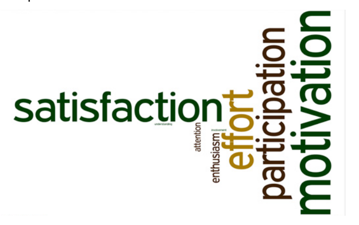
Fig. 1 – Impact of ICT on students.

interest in learning, provoking a desire for involvement and a sense of satisfaction, which shows that ICT is a didactic tool and a promoter of success in education.