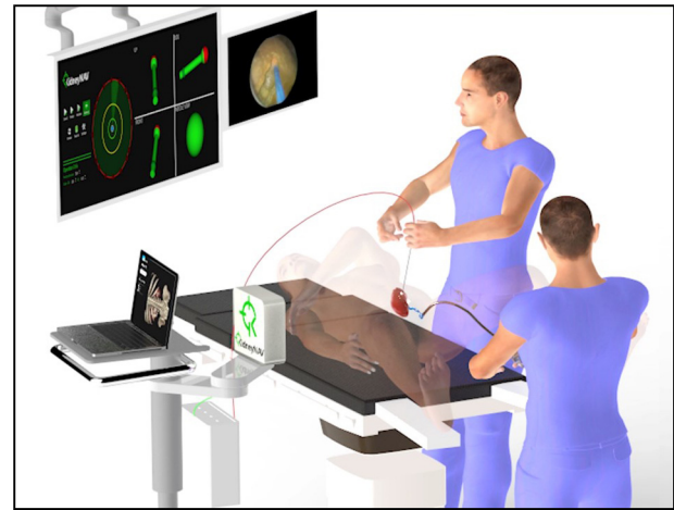
Fig. 1 – Surgical set-up for puncture of the renal collecting system using electromagnetic sensors. A research group from the University of Minho (Braga, Portugal) has patented this new navigation system. The technology consists of the following components: (1) software for surgical guidance developed specifically for this work, which acts as a control station by gathering and processing information from different equipment needed for puncture for percutaneous nephrolithotomy; (2) an electromagnetic field generator placed on the opposite side of the puncture, close to the patient; (3) one 18G needle and one ureteral catheter, both with an electromagnetic sensor on the tip; (4) a monitor with a four-view 3D representation of the trajectory orientation and position of the needle and catheter; and (5) a monitor displaying the ureterorenoscopy video image.

Patients underwent standard preoperative anesthesia testing. A computed tomography (CT) urogram with three-dimensional (3D) reconstruction was also obtained. Patients with negative urine cultures were treated with a single prophylactic dose of a broad-spectrum antibiotic.