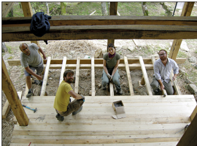
Fig. 6 – The floor planking.