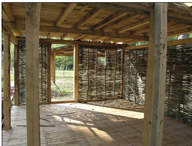
Fig. 8 – Wattle made of freshly-cut hazelnut branches.

suggests the dwelling's elevations of two floors, with a second pavement of planks laid out over beams.