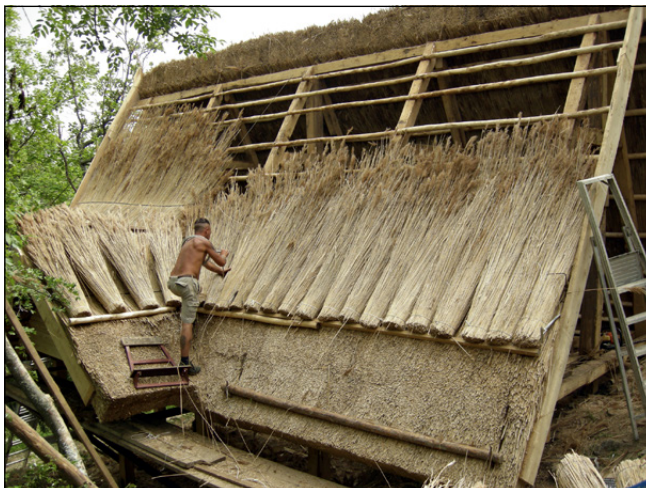
Fig. 9 – Roof material: water reeds.