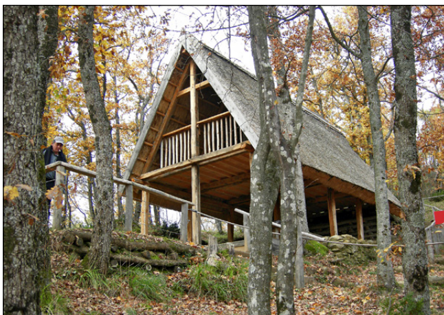
Fig. 10 – A Pianella’s house full reconstruction.

use of materials readily available on-site: wood, leafy branches, earth, straw, or water reeds (as in ORTALLI 1995). There was no way of choosing anyone else of these alternatives from an objective basis, so we opted for the last, in consideration of the fact that this material had been widely used in ancient Italy and was readily available also in hilly territory. Before being fitting them to the roof frame, the reeds were selected according to length and packed into