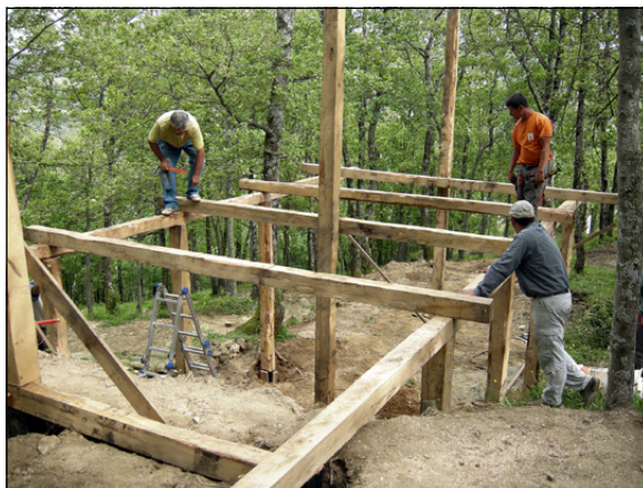
Fig. 5 – The distance of the posts.