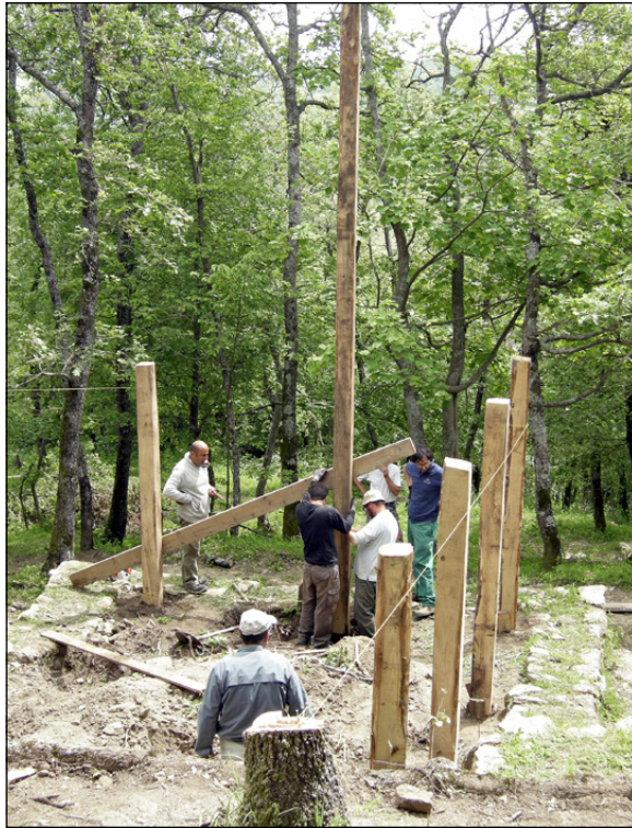
Fig. 4 – The vertical woodwork of the house.