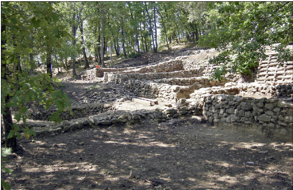
Fig. 3 – The walls consolidate the terracing of mountainside.