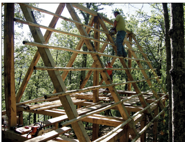
Fig. 7 – The roof's purlins.

wedges and plugs, were used, but also iron nails, as proved by the archaeological excavations. The floor planking was not preserved under the collapse levels of the dwellings, but traces of it have remained as impressions underneath the clay firedogs (Fig. 6). The fact that the planking level was elevated above the ground is a reasonable hypothesis, as it would have allowed ventilation and proper insulation from ground humidity. The verticality of the structure