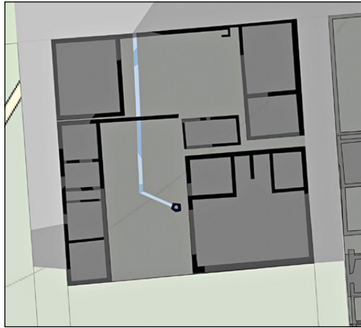
Fig. 2 – Schematic render of structures of Marzabotto's House 1, Regio IV, insula 2 (after Govi 2010).