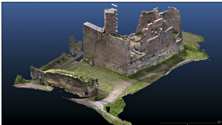
Fig. 3 – Screenshot of the photogrammetric model of castle Hohenecken in CloudCompare.