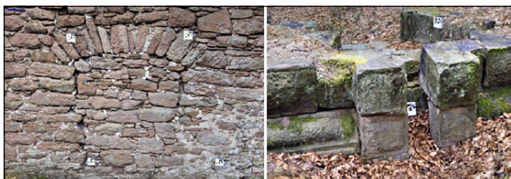
Fig. 4 – Photogrammetric screenshots of a portion of the wall at the Commandry in Einsiedel (left), and a portion of the wall at castle Perlenberg (right).