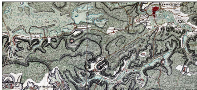
Fig. 1 – Excerpt of the map of the Palatinate Forest, from Jean-Jaques Nadin, 1736/1737.

the visual component are to merge SfM and laserscan models of each of the ruins of the six sites, in order to combine the high resolution imagery of SfM and measuring strength of Terrestrial LaserScan (TLS) data. Once digitized as merged 3D-models, the sites will be digitally examined, and placed atop the Aerial LaserScan (ALS) data of the terrain.