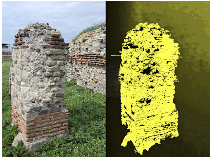
Fig. 3 – RGB-D scan survey: colorimetric information (right) and depth map (left).

the Roman theater of Litternum. Since the sensor requires, for its operation, a constant power supply in addition to a connection to a laptop, the device has been connected to an uninterruptible power supply via an IEC / SCHUKO cable of suitable voltage. In this way, the system becomes transportable and usable for a time interval appropriate for the acquisition of small elements. In reason of the limitations associated with the illumination of the captured scene, the survey was carried out in diffuse natural light condition (cloudy sky). The definition of the trajectory to be followed with Kinect for the pillar survey took into account an important factor. A well-known problem of Simultaneous Localization and Mapping (SLAM)-based reconstruction methods is loop closure. If the user makes a 360^\circ turn, the final estimated position of the sensor will be off by a few degrees, and objects that become visible again will not coincide with the first observation. As a result, gaps or ghost objects appear. So, to avoid this problem, the device has been used by turning around the masonry block, from the top downwards, and scanned with a zig-zag pattern. 1 scan, divided into 32 depth frame, has been recorded (Fig. 3).