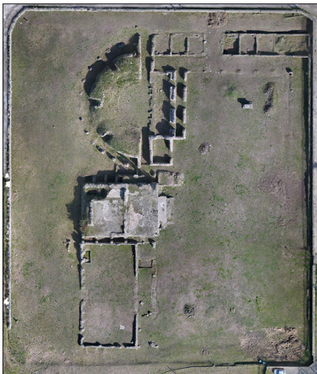
Fig. 2 – Archaeological site of Linternum, orthophoto: photogrammetric survey.

3) 3D laser scanner survey of some details carried out by a low-cost, consumer-level hand-held RGB-D sensor in order to compare the results.