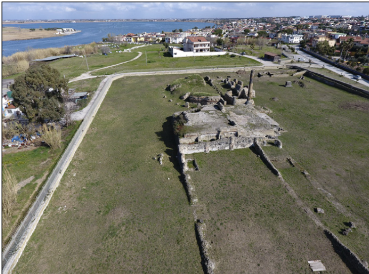
Fig. 1 – Archaeological site of Liternum, aerial view.