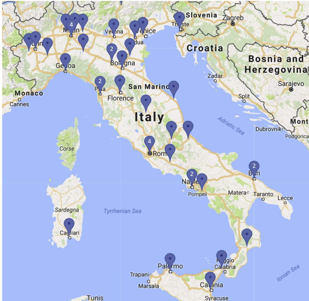
Fig. 1. Map of the location of clinical centers of LIPIGEN Network in Italy.