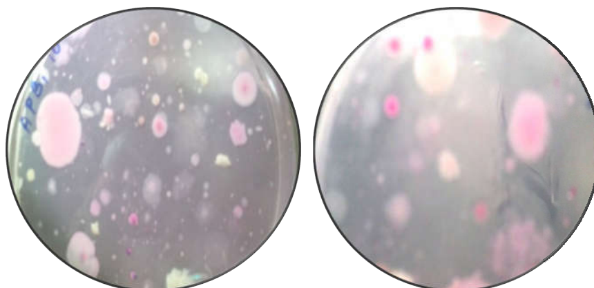
Fig. 2: Phosphatase-producing bacteria on phenolphthalein-phosphate agar (Pink-coloured colonies indicate mineralization of organic phosphate)

Phosphatase-producing bacteria were isolated using phenolphthalein-phosphate agar. The bacteria which are able to produce phosphatase enzyme utilized the phenolphthalein phosphate as a source of phosphorus, and breaks down into phenolphthalein and phosphate. When the colonies were exposed to ammonia vapour, pH of the media increases, pink colouration indicates the formation of phenolphthalein (Fig. 2).