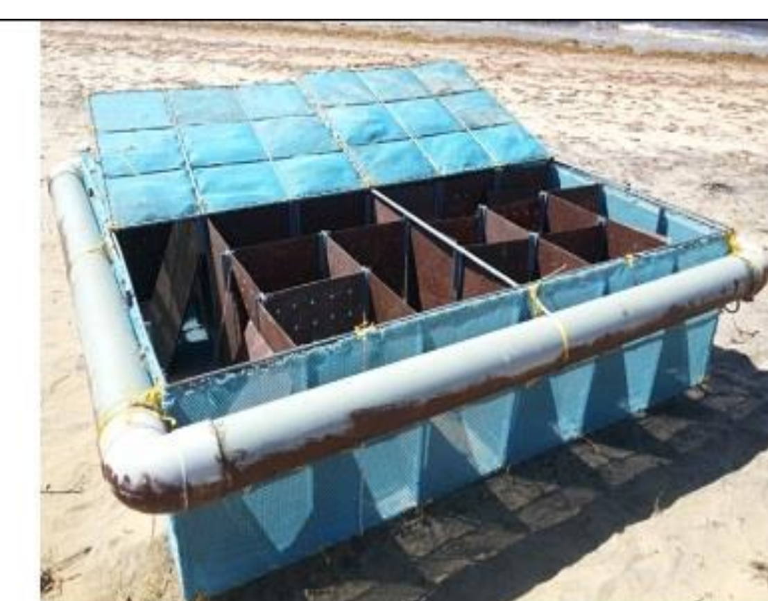
Fabrication of FRP crab cage : Model-II