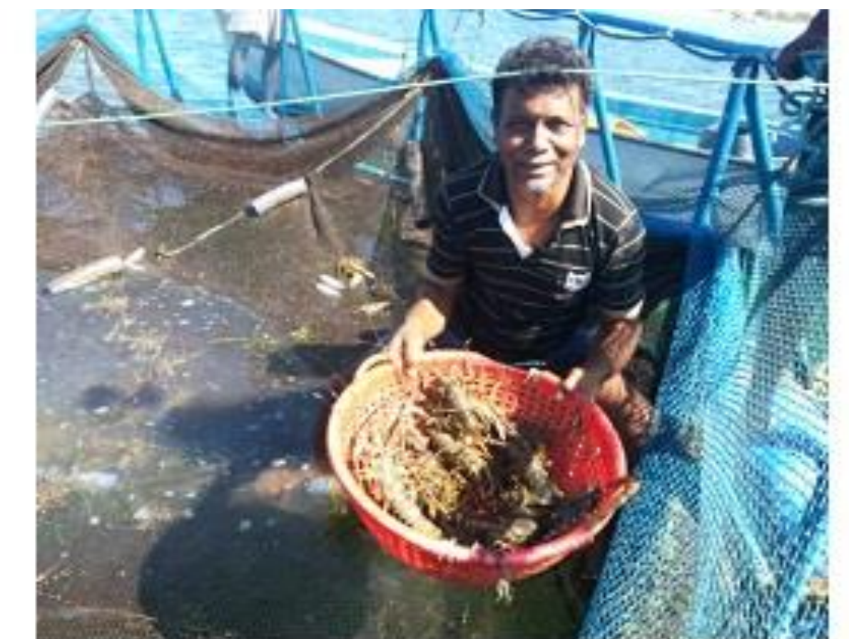
Grading of lobsters for marketing