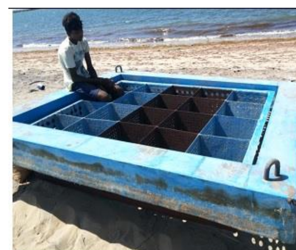
Fabrication of FRP crab cage : Model -I