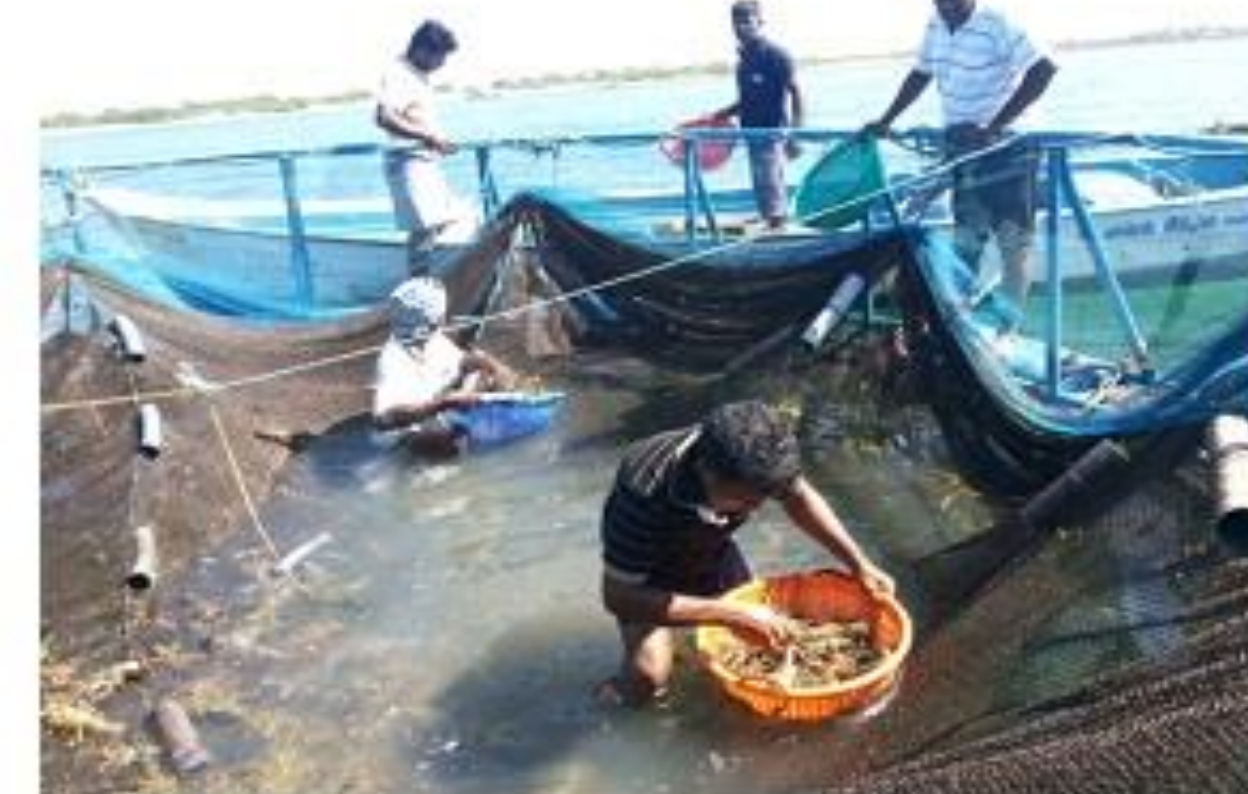
Lobsters harvested in sea cage

Grow-out culture was carried out for a period of 5 months. The final average weight of the grown lobsters were 211 grams with 95 % survival at the time of harvest.