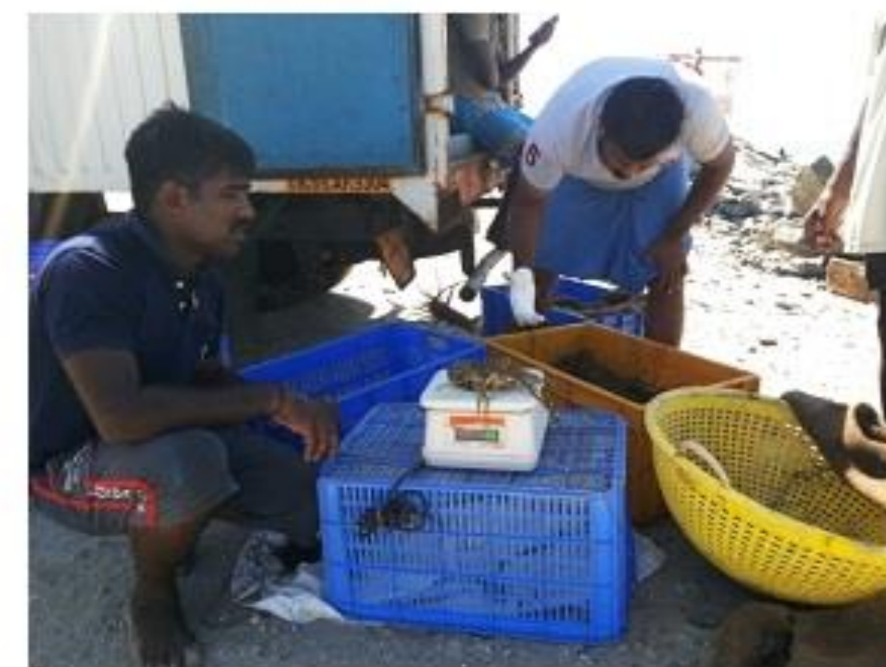
Procurement of grown lobsters from sea cages