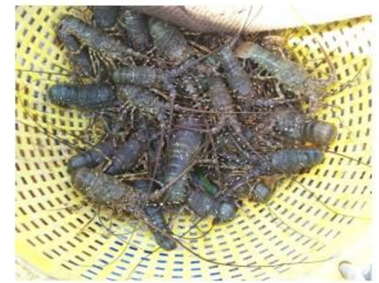
Part of harvested lobster