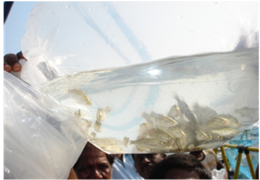
Sea bass seed ready for stocking