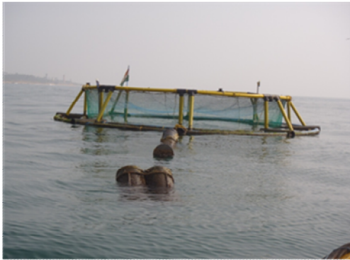
Cage anchored in Sea

the changes in the water quality parameters at the site; so that changes in the water quality parameters from the site could be observed and predicted and accordingly preventive decision could be taken in advance. Frequent recording of important water quality parameters like ammonia, nitrite and nitrate, pH, turbidity and temperature will give a clear idea about cage environment and also will help to understand the health status of the animals in the system.