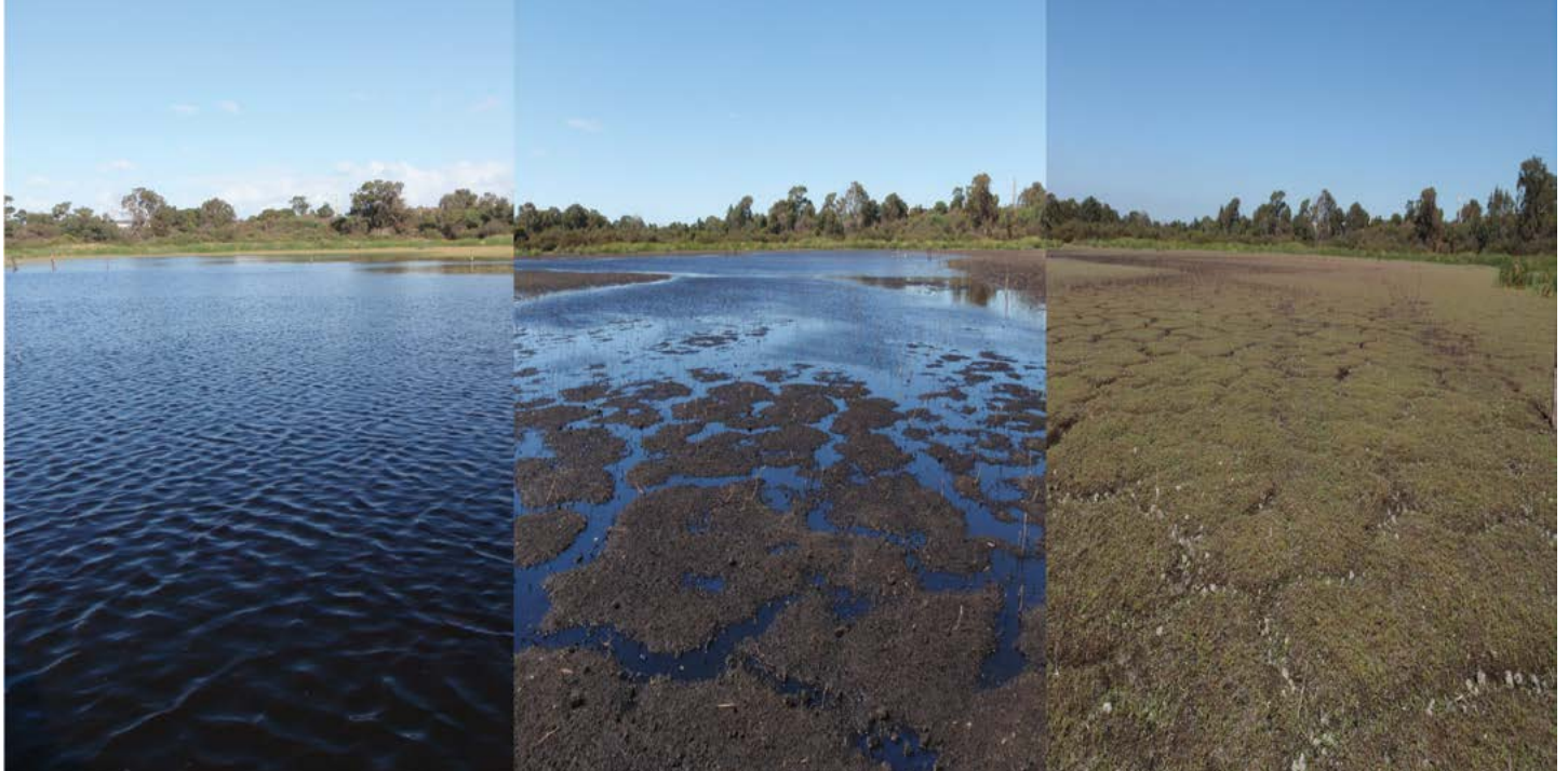
FIGURE 2 The three stages of South Lake, (right to left) flooded, drying out and dry: these cracks and fissures in the drying sediment enable many freshwater invertebrates to survive hot dry summer conditions

seasonally-dry wetlands. They also showed that some aquatic insects survive drying as larvae, preying on stranded invertebrates or consuming organic matter, and then emerge as flying adults after the wetland has dried out.