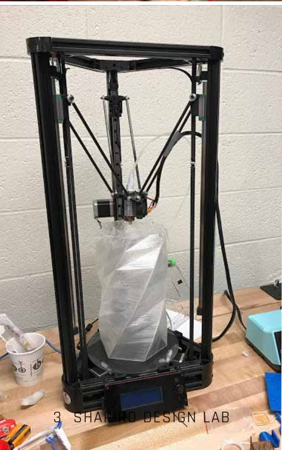
3 SHAPRO DESIGN LAB