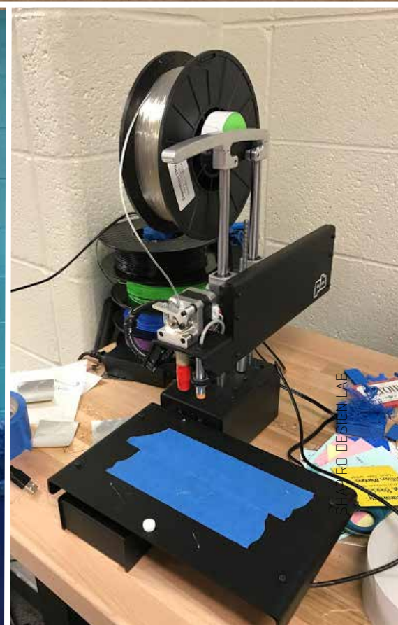
SHAPRO DESIGN LAB