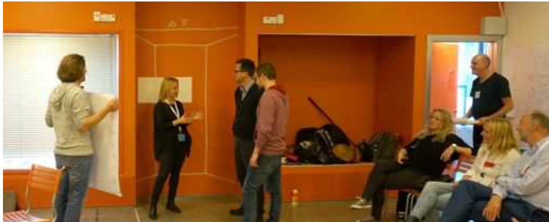
Presentations – short pitch

After two iterations of mapping each group created a sort pitch of a chosen idea or concept for external representatives from the library leader group. After the pitch presentations the participants were asked to vote for their favourite idea/concept.