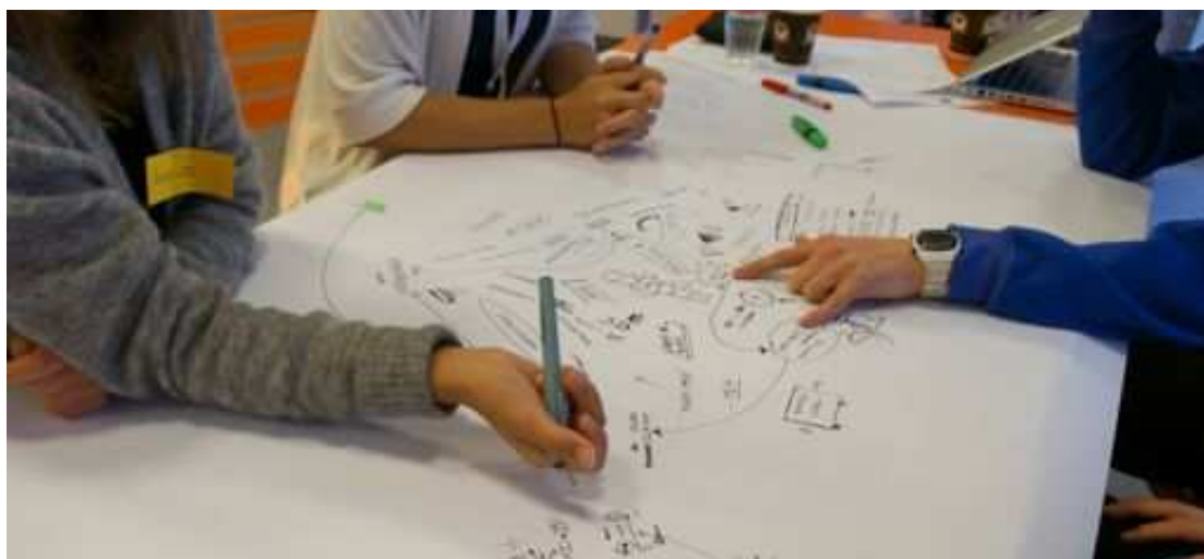
Group work - mapping task

All of the above themes where limited by a single factor due to predicted low library budgets: "The solution must be (as far as possible) self-generating and building on the actors and the audience's initiative and production"