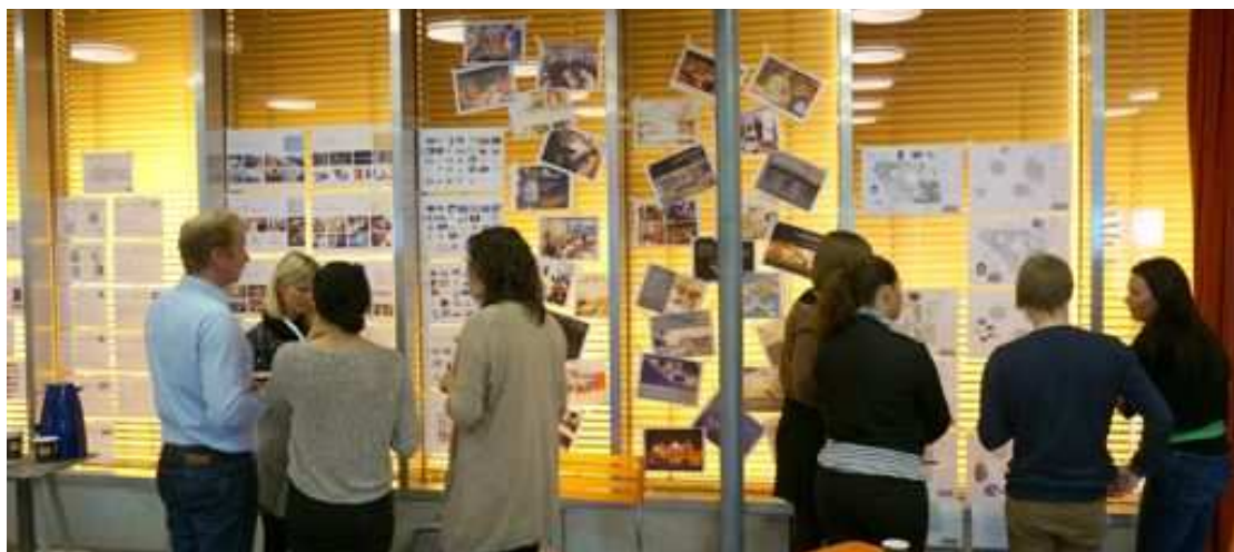
Case - information gallery wall

The main theme for the workshop was to develop solutions for shared spaces at the new national library that will be realised at Bjørvika in Oslo in 2017 (for more information see: http://blogg.deichman.no/nyedeichman/ ).