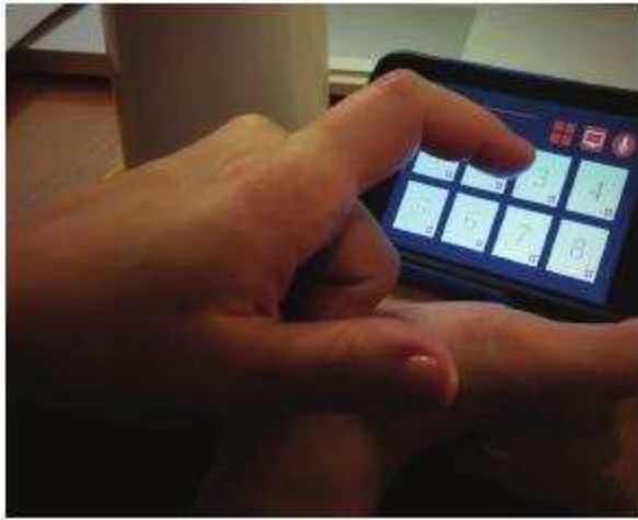
fig 2. Sampler mobile interface.