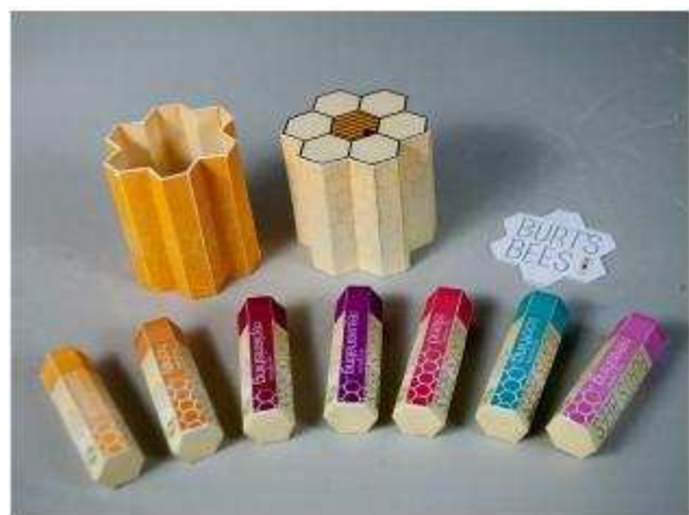
fig 1. Burt's Bees Rebrand by Eric Sachs.

Even assignments that require systemic solutions are not contextualized in a broader, systemic sense, particularly from a critical point of view. The boundaries of the assignment’s system are not critically explored. For example, an identity redesign project that Kaiser taught does not ask students to question the brand’s purpose or to re-imagine the nature of the brand itself. It asks for a purely visual solution: design a new logo, new letterhead, new promotional collateral. This sort-of design project applies boundaries that are form-determining, driving the focus of the students towards a limited view of elements and, when present, the relationships between those elements (fig. 1). Midgley (1996) acknowledges the importance of the application of boundaries, even in critical systems thinking, where, without boundaries, critical thinking will “inevitably fall into the trap of continual expansion and eventual loss of meaning” (18). At the same time, a lack of criticality results in a “hardening of boundaries’ where destructive assumptions remain