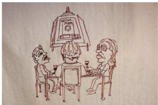
fig 5. Jumbotron