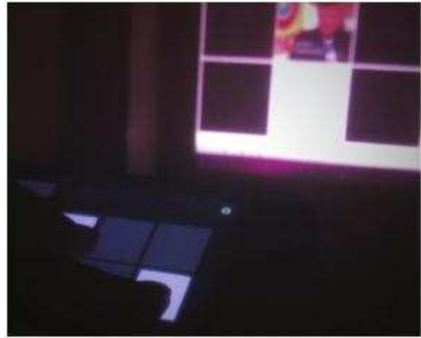
fig 3. Sampler web interface as affected by mobile interaction.

the web-based interface (fig. 3) to go back and reflect on his or her experience and the relationships he or she identified. Having moved our students through the elements and relationships within a system, it becomes imperative to complete the continuum through an elucidation of the ideologies embedded within.