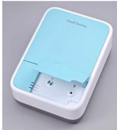
Figure 2 – The OralChroma.