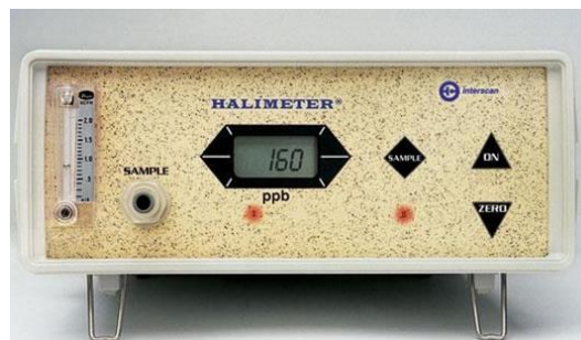
Figure 1 – Halimeter.

These portable machines have a lot of advantages: easy to handle, fast results, portable and reproducible. Furthermore, they are rather inexpensive and can be controlled by untrained staff. As disadvantage, the limited diversity in the explored gases should be stated. More recently, it was shown that the OralChroma may produce a more comprehensive assessment of VSC production by oral microflora than the Halimeter. It would be desirable to select one machine as a gold standard to make different studies comparable in the future (Salako, 2011).