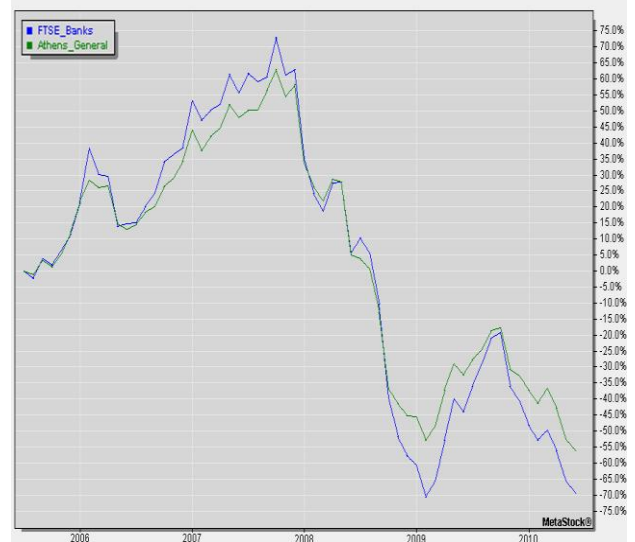
Figure 2: General and Banking Indices 2005 – 2010

Nevertheless, the extraordinary performance of the banking sector during the period 2004-2008 was reversed in the year 2009 following strong pressure on the Banking Index because of the economic turmoil; leading to a sharp deterioration in the “FTSE ATHEX Bank Index” starting from January 2008 (figure 3) (Deloitte, 2010).