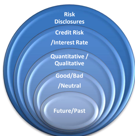
Figure 3: Schematic of the Coding Design

The first step of the design process separates credit from interest rate risk. In each category only disclosures pointing directly on one of the two types of risk are included. More specifically, phrases like “negative economic and financial environment” are not included even if credit and interest rate risk are implied by the term financial.