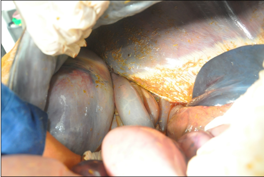
Figure 3. Post-mortem image of the thoracic cavity where small and large intestines pushing through the large linear tear at the right dorsal border of the diaphragm at the border of the muscular and fibrous portion. The edge of the tear was smooth, and no adhesion was evident. The tear was estimated to be about 15 cm in length